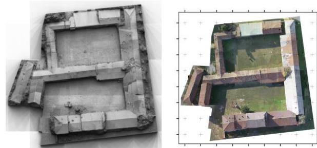
Figure 11 Depth maps obtained with MicMac (shaded mode) (left) and achieved orthophoto (right)

In order to evaluate the accuracy of the obtained orthophoto, several CPs were compared with the coordinates obtained from the traditional topographic survey. The discrepancy between the two coordinate set for all of the CPs was close to 60 cm, with some “outliers” close to 2 m along the borders of the orthophoto.