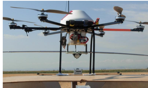
Figure 3 The Microkopter hexacopter modified by RESTART

Like the previous hexacopter, it is possible to have an autonomous flight, and a flight plan can be realized.