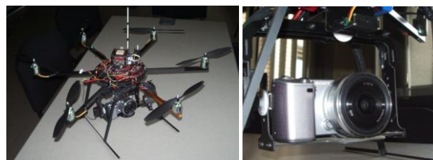
Figure 1 First version of Mikrokopter hexacopter (left); on board camera (right).

This system is a commercial solution available off the shelf and is a cheaper tool than the traditional UAV (Figure 1, left). Its cost is less than 5000€, considering the commercial kit and assembly step.