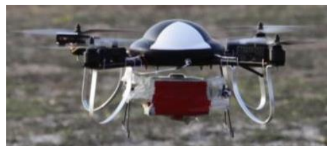
Figure 4 DRACO system

Using the controller, the pilot can also create a mission, set the flight plan, set the shooting time, and so on. The duration of the flight is better: 16–18 minutes.