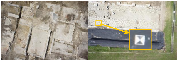
Figure 8 Two acquired images in the area of Via Gemina: high flight (left) and low flight with a zoom on a target (right).

The results of the photogrammetric process are shown in Table 1, where the standard deviations on the GCPs and the CPs are reported ( \sigma_0 = 10 ).