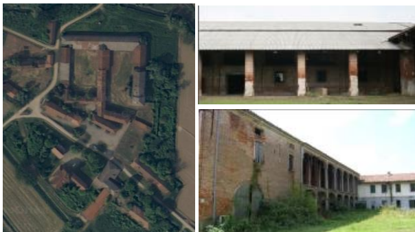
Figure 10 Aerial view of Leri Cavour (left) and two images of the actual state of the main buildings (right).

Leri Cavour (Figure 10) is an abandoned farmstead complex that is under a regional requalification project.