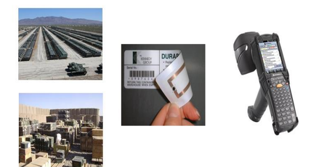
Figure 1. Connecting RFID tags to all military logistics (supplies) in all garrisons in order to control incoming and outgoing logistics via readers.

We can determine the status of all garrisons (type and number of pieces of weapons and so on) by connecting RFID tags to all existing logistics (supplies) in garrison stocks. Logistics (supplies) leaving the stock for deployment should pass a manual_reader or a gate with a reader installed on the it so that the information of the tag is read and the date of departure is sent to a server in distribution center. The information stored on a tag includes logistics type, garrison name, main distribution center and production center.