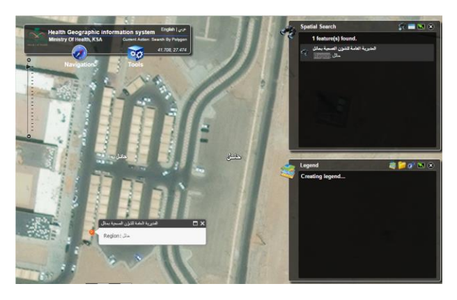
Fig. 2: Health Geographic Information System web portal (MOH, 2013).

Health Geographic Information System web portal has been launched as the early implementation initiatives within Ministry of Health. With the aim to provide an online services providing information and guidance for health facilities and basic related map queries as shown in Fig.2. To broader the GIS applications in health, Murad (2004) had discussed the potential of a creating GIS application for local health care planning in Saudi Arabia. He identified several tools required for that purpose: 1) Geo-coding; 2) Overlay analysis; and 3) Network analysis. The proposed GIS information includes population density, diabetic patients modelling patient flows, blood pressure, asthma patients and populations (Murad, 2004).