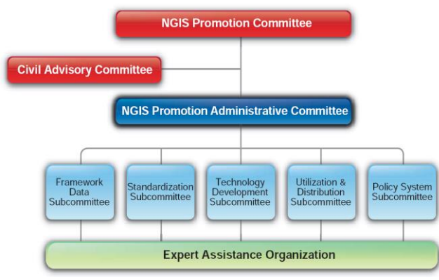
Fig. 3: Korea's NGIS administration structure (KRIHS, 2007).