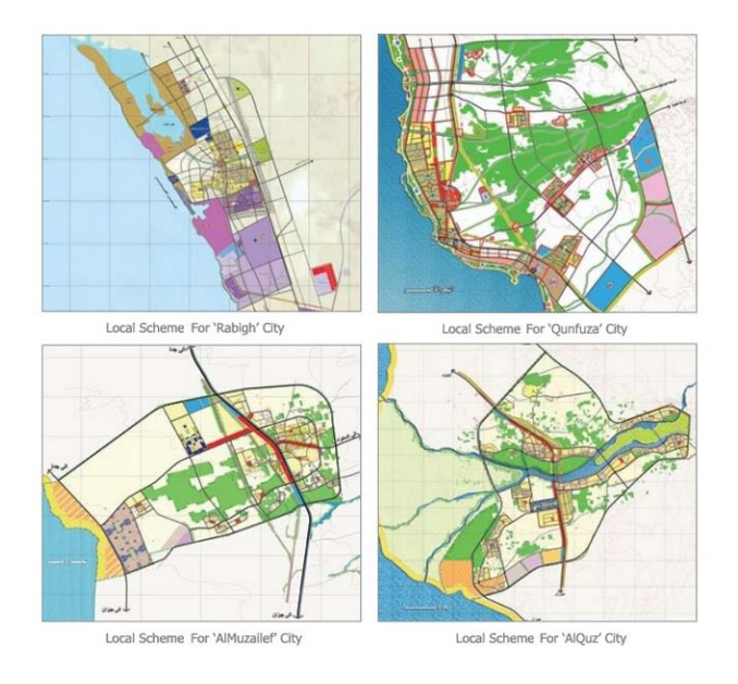
Fig. 1 : Example of GIS datasets in Province department within Jeddah Municipality (Municipility, 2015).