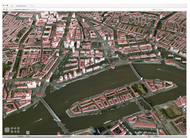
Figure 2 3D Model of the city of Rotterdam

The first case study uses utilizes a Java applet based on Nasa World Wind with an optimized custom-rendering engine for 3D buildings. The data are exported from 3D CityDB at LOD2 in CityGML format, and are loaded in a custom servlet, which parse and transform the CityGML file into an OBJ compatible format called C3D. This custom format, optimized for size and parsing speed, contains only hierarchical, geometry and reference information which is then used by the client to get an object id to query a WFS service to potentially obtain all the information present in the 3D CityDB.