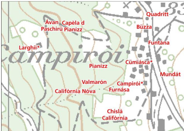
Figure 3: On a 1:25.000 map the localization of place names is far from being self-intelligible for normal people who are not familiar in reading and orienting maps and may fail in giving precise information. (© Swisstopo)