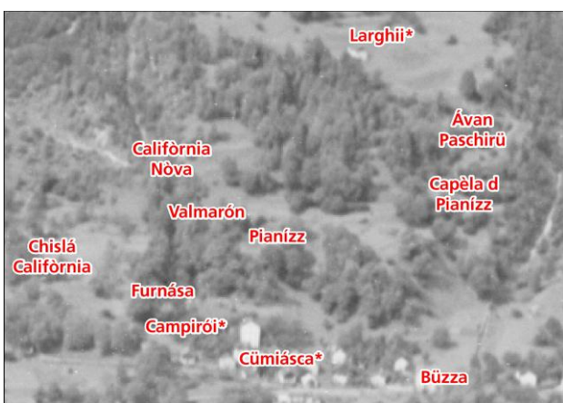
Figure 5: Precise localization of place names on a historical terrestrial picture. Most sites are perfectly recognizable in their original shape before the abandonment of traditional land-use.

Terrestrial historical photographs additionally present the unique advantage of reproducing the landscape under human's everyday perspective and perception. This makes not only the localisation of the place names on the picture easier, but in many cases also recall additional details to the memory of the informants (Figure 5).