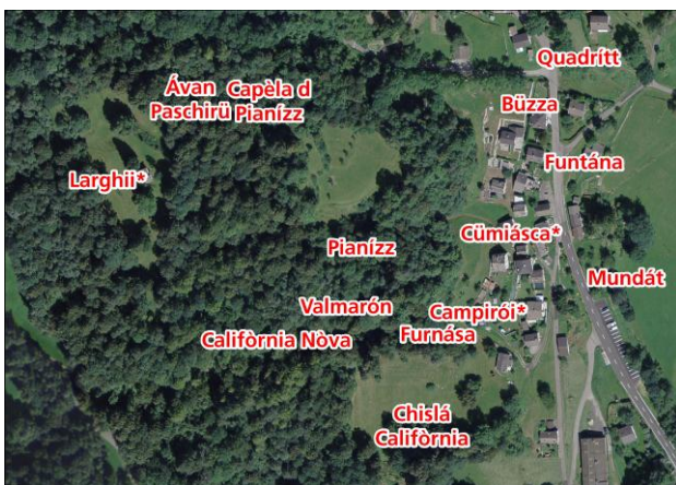
Figure 4: Localization of place names on recent orthophotos may reach a good precision, but many of the sites are hardly recognizable because of the new colonization by forests.