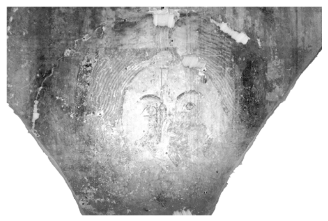
Picture 5. Christopher depiction - Orthoimage from FARO Focus 3D

Based on a 3D point cloud that covered the entire area of the building west transept, all subsequent results are geared towards. By the intense representation of points scanning, all photographs could be integrated using natural control points in the point cloud. Thus, all data are combinable, and may be overlaid for example. In the following illustrations it is clearly apparent in what extent the spectrum of pictorial detection expends by the different imaging techniques allowed. (pic.5 –