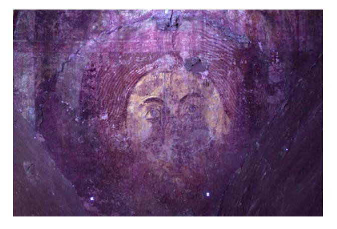
Picture 8. Christopher depiction - UV-fluorescence photograph, rectified

<sup>*</sup> cf. A.Porst, R.Winkler, in RESTAURO 1/2012 S.16-24