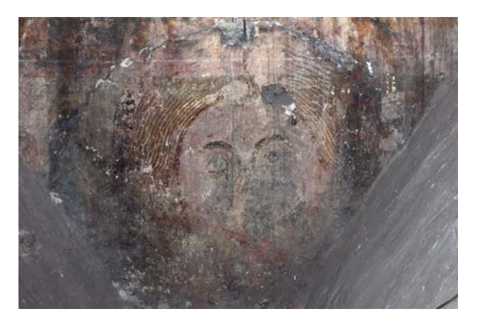
Picture 6. Christopher depiction - high-resolution digital photograph ©by beckett&beckett, rectified ©by G.Gresik

10) This is an area of the west wall of the transept above the gothic arch, which has already been investigated by restorers between 2003 and 2009<sup>*</sup>. However, this should be shown in this course of the current works uniform combined with the church room, so that the entire wall surface can be further processed in a system.