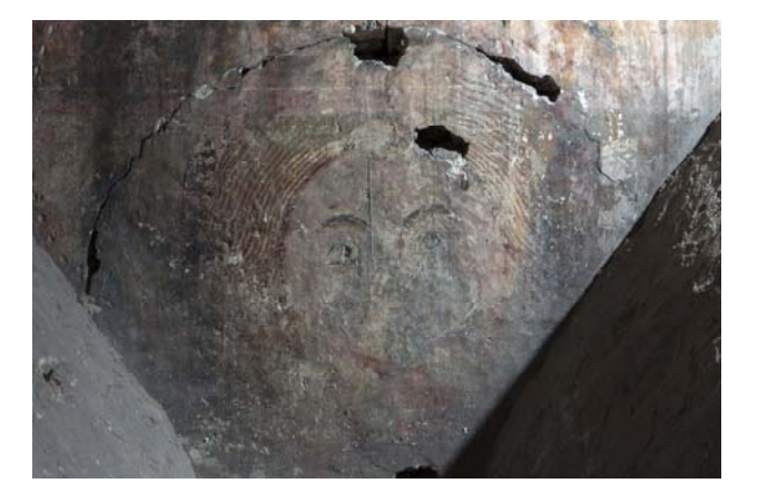
Picture 7. Christopher depiction - grazing light digital photograph ©by beckett&beckett, rectified ©by G.Gresik