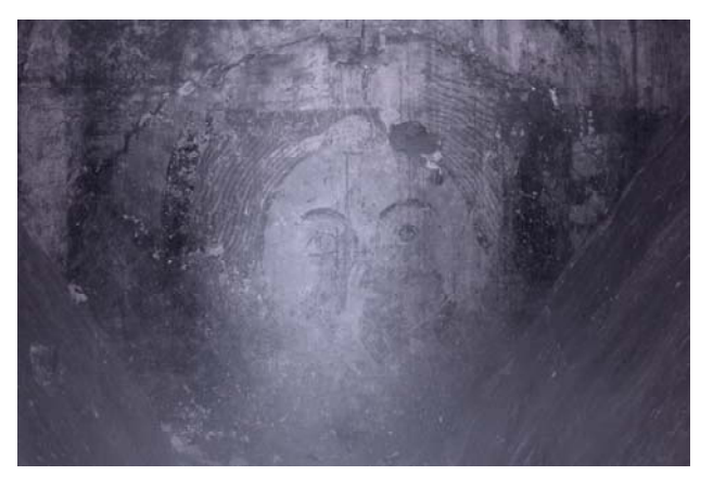
Picture 9. Christopher depiction - IR-reflectography digital photograph ©by beckett&beckett, rectified ©by G.Gresik

<sup>*</sup> cf. A.Porst, R.Winkler, in RESTAURO 1/2012 S.16-24