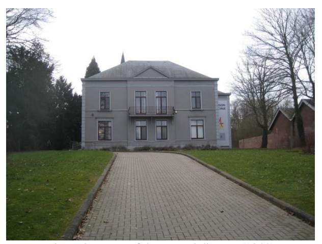
Figure 3: House of the general director (1844)