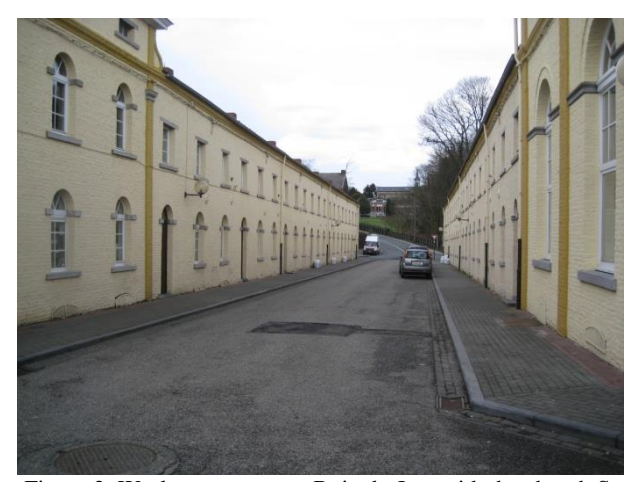
Figure 2: Workers quarters at Bois-du-Luc with the church St Barbara, the hospital, the school for the girls, the hospice, the houses for the engineer and employees, the park with its kiosk, the butcher and "glacière" and school for the boys and the library on the background

From 1838 to 1853, 166 living quarters were built for the housing of the workers, as commissioned by the mining management in order to attract and attach the workers (Figure 2). Moreover, a separated living quarter was built in 1844 for the general director (Figure 3), as well as a grocery, butcher and "glacière", party hall, park and its kiosk, church, schools, library, hospice, hospital, school, houses for employees and engineer, mill brewery. Bois-du-Luc is an illustration of an exemplary conservation of the paternalistic ideology. In 2012, the entire mining site of Bois-du-Luc was recognized as World heritage by UNESCO, next to three other important mining sites in the Wallonia.