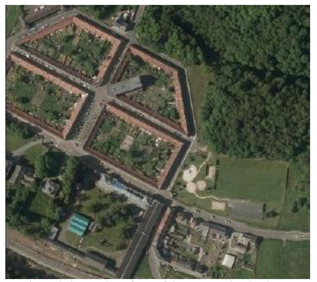
Figure 4: Screenshot of one of the generated orthophotos

In order to perform the exercise, a stereo couple is supplied by the Walloon Region. Reference points and ground control points are measured using RTK GNSS and the WALCORS reference network with centimeter accuracy. The coordinates of both materialized polygon points and unambiguous image points are defined in the Belgian Lambert 72 system. Initially, at least twelve ground control points have to be measured by the students. These points, as well as the calibration parameters of the images, are processed using professional photogrammetric software. This process results in an orthophoto and DEM of the site. A screenshot of the orthophoto is presented in Figure 4.