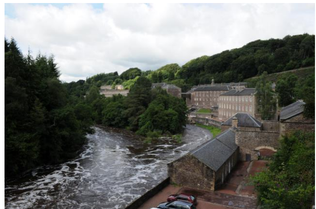
Figure 1. New Lanark village © CDDV 2009.

The village of New Lanark is located in a stunning valley setting close to the famous Falls of Clyde and surrounded by native woodlands (Figure 1). It was founded in 1785 by David Dale as a completely new type of industrial settlement. Cotton-spinning mills, powered by water from the River Clyde, and tenement style housing for the workforce were built from local sandstone. Under the management of Dale's son-in-law, Robert Owen, the village became a model industrial community, with no child labour or corporal punishment and with provision of good housing, schools, free health care and affordable food for the villagers. By 1820, the population of the village was around 2,500, and it was the largest cotton-manufacturing centre in the country (Donnachie and Hewitt 1993). It is now a popular tourist attraction managed by New Lanark Trust and is home to the New Lanark Visitor Centre and New Lanark Mill Hotel. It became a UNESCO World Heritage Site in 2001.