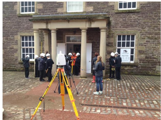
Figure 5. Schools workshop on 3D survey and design at New Lanark © CDDV 2012.

Community engagement was an important part of the project at New Lanark and in 2012 the Scottish Ten ran a schools workshop in partnership with New Lanark Trust. This focused on the principles of 3D survey and 3D design with the students gaining hands-on experience in survey measurements, photography, laser scanning and 3D modelling using Google Sketchup® to produce their own 3D model of a building at New Lanark (Figure 5).