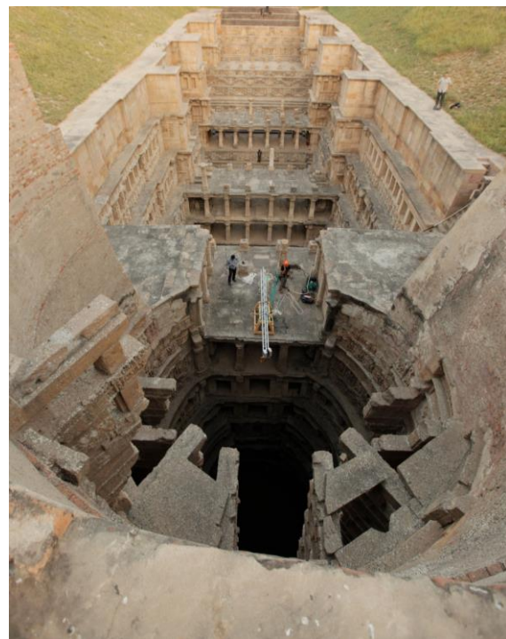
Figure 8. Specially designed rig with laser scanner attached and suspended over centre of well to capture areas not visible from other vantage points © CDDV 2011.

CyArk's role at Rani ki Vav was in on-site data management. As scans were completed, they were passed to the CyArk team for download, backup, import and database compilation. Having a dedicated data manager was critical to ensure there were no voids in the data.