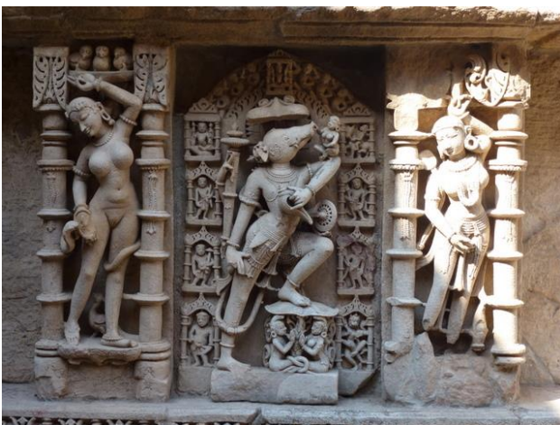
Figure 7. Sculptural detail at Rani ki Vav stepwell, Gujarat, India