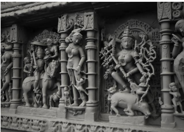
Figure 10. Mesh of sculpture obtained from close-range structured light scanning at Rani ki Vav © CDDV 2012.

Despite its architectural significance, Rani ki Vav is not widely known outside India and currently sits on UNESCO's Tentative List for World Heritage Status. By digitally documenting Rani ki Vav for the Scottish Ten project, the Scottish Ten team aimed to bring the site to a much wider audience and raise both its national and international profile. The ASI has submitted a bid to UNESCO for full inclusion on the WHS list, and Scottish Ten project data and derivatives have formed part of this proposal.