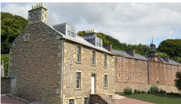
Figure 3. Photo-realistic model of Robert Owen's House at New Lanark © CDDV 2010.

A fully photo-realistic model (Figure 3) was generated for the entire village and working closely with New Lanark Trust, this was developed into a virtual tour, interlaced with archival imagery and oral histories. New Lanark Trust now use this tour as an educational resource within their visitor centre and it will soon be available to view on their website.