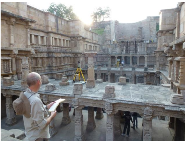
Figure 6. Rani ki Vav stepwell, Gujarat, India © CDDV 2011.

The site was only re-discovered in the 1950s as it's many levels had been backfilled with silt over the centuries. As a result the ornate carvings are excellently preserved.