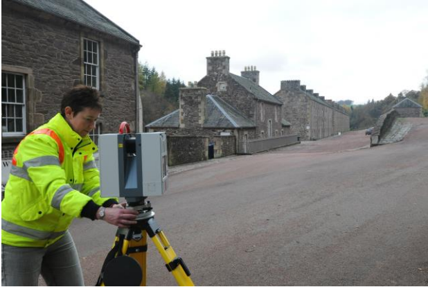
Figure 2. Terrestrial laser scanning with a phase-shift scanner at New Lanark © CDDV 2009.

HDS 6100) scanners (Figure 2), and HDR 360 degree photography, using a Nikon D3X camera and Nodal Ninja® 5 camera mount to position the nodal point of the camera lens at the same height as the laser sensor within the scanner. In total, over 100 scans were made. Accurate positioning was enabled by use of Leica 1200+ GNSS system. In addition, airborne LiDAR and orthophotos were collected for the entire site at 0.5m point spacing.