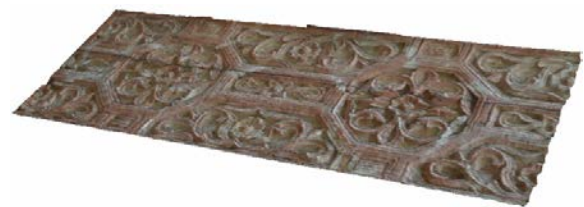
Fig.2 3D model of Roshan decorative panel

According to Etani et al (2011) Dense stereo matching (DSM) as digital modeling technique offers unexpectedly good 3D results, from many perspectives because it has high geometrical precision with high level of visualization. This is why Dense stereo matching (DSM) technique was used in documenting the roshan and its components as can be seen in and it yielded very good results