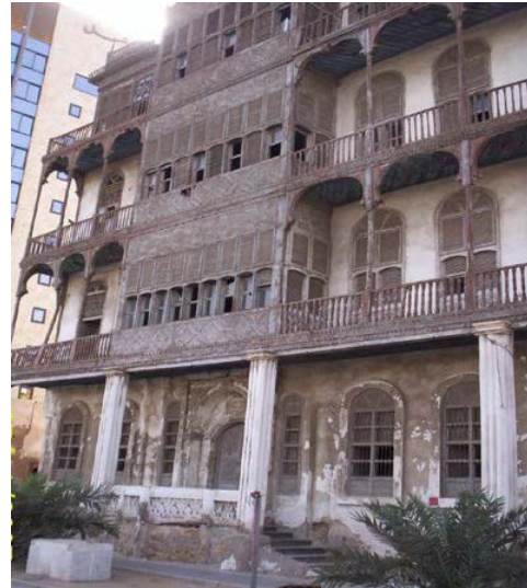
Fig 3. Rawasheen in Sharbatly building

This protection can take several forms such as lowering the light level; removing the more harmful UV radiation by means of filters; using a light diffuser for artificial light source which will reduce the intensity light falling on objects; and reducing the amount of time that wood is exposed to light.