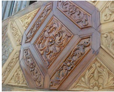
(a) New panel with similar decorative pattern