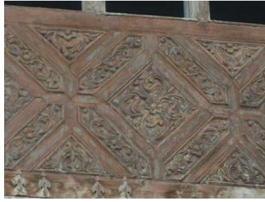
(a) Original decorative pattern of Roshan panel