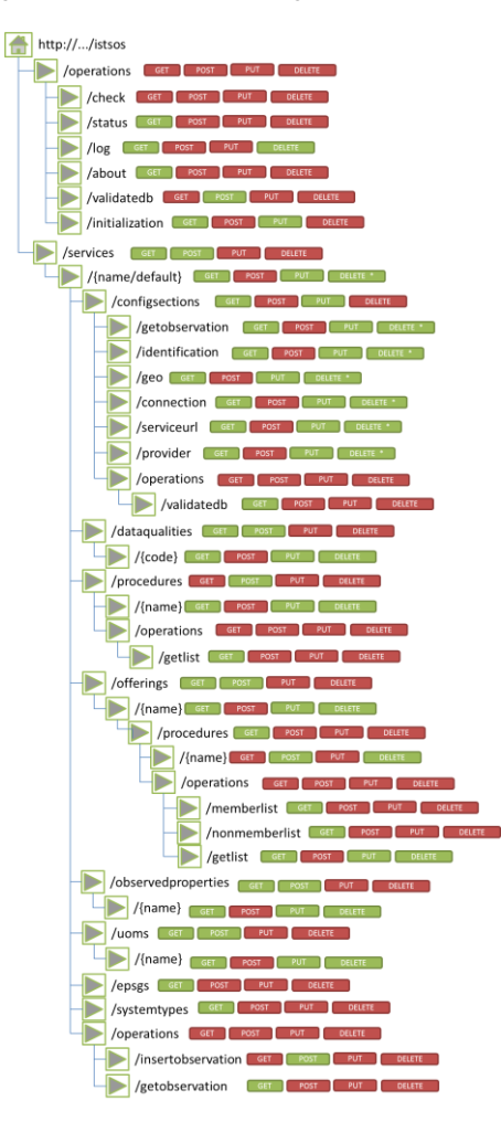
Figure 2. Elements and relative HTTP method supported in the walib

In addition to common actions aiming at manipulating elements, the walibs offers features to perform general operations like enquiring for service status or testing the database connection.