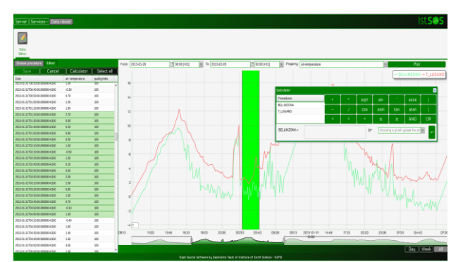
Figure 3. wainterface: data editor snapshot

The third section of the interface is the data editor (see Figure 3) panel that provides access to observations display and editing. Once the desired time series (service, offering and procedure) are selected, the administrator has to define a time interval and an observedProperties : at this point observations are plotted in a chart and displayed in a table. If desired, an editing session can be started. Within the editing session the administrator can select observations, either interactively on the plot or on the table, and adjust values either editing the selected rows or applying formulas using a calculator where values from other series can be used. Modifications are immediately visualized, and committed only once the save button is pressed.