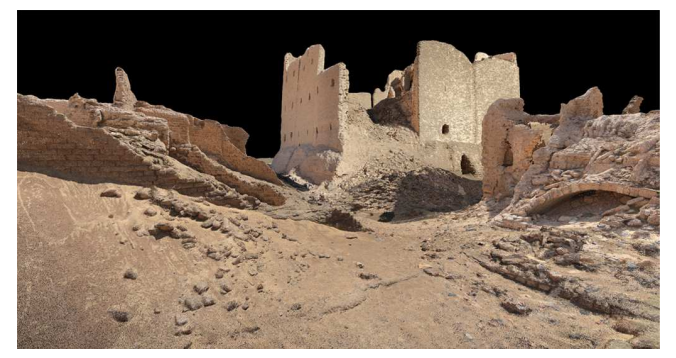
Figure 6. An interesting "Point Cloud view" of the central castle from the actual entrance.

The average base/distance ratio was of 0.1. When in the presence of long walls, as for external wall block, convergent images were also acquired assuring a B/D ratio of 0.5. In the presence of sharp edges, the image base was reduced. For more simple building was used a circular convergent capture geometry centred in the hypothetical centre of gravity of the object and moving the camera of circa 10^{\circ} .