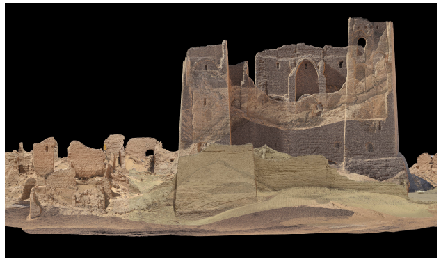
Figure 5. Orthoimage of the external façades of the castle. In transparency the internal areas. It is clearly possible to study the level of internals remains and buildings techniques.

Averagely the capture distance was around 10-15 meters for building acquisition and 5-6 meters for the details. Only for the central castle was used a largest distance, circa 15-20 m. The choice was taken for two reason: i) to facilitate the acquisition in a single block of the high castle walls and ii) to frame in the foreground all the surrounding structures useful for the automatic recording of the blocks. The sensor resolution and the planned capture geometry assured a medium GSD (Ground Sample Distance) of 1mm for front objects (object of the survey) and a max of 5 mm for back objects (useful for registration with others block). The images were acquired with a mean overlap between two consecutive normal views of about 80% to guarantee the automated identification of homologous features and assure a minimum number of intersecting rays for improving reliability. The mean baseline between adjacent images was about 1.5 m with a max of 5 m for more distant object.