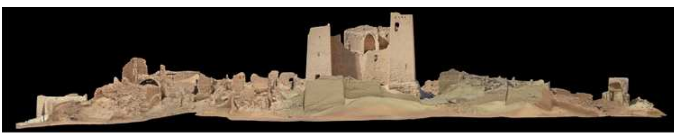
Figure 8. The south view of the settlement extracted from the high-resolution point cloud.

Ikram S. and Rossi, C., 2002. Surveying the North Kharga Oasis. KMT 13(4), pp. 72-9.