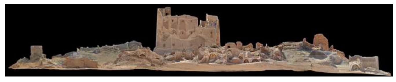
Figure 9. Northern Prospect of the Fortified Settlement (slightly transparent).