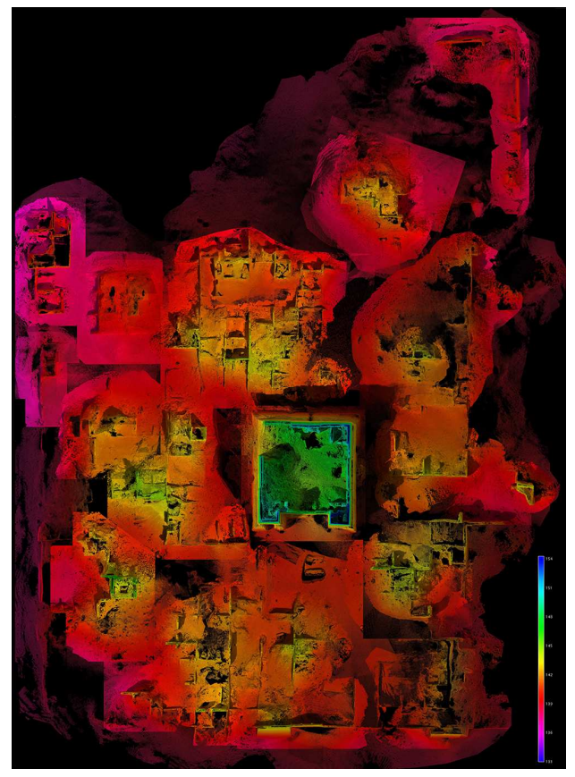
Figure 7. Orthophoto of the complex. The images is visualized as a depth map to better understand the different elevation of the buildings.

The survey can be used to study the layout of the settlements, the alignment of the various buildings, as well as the design of the various units. Finally, these data can also be used to prepare a digital reconstruction of the original appearance of the site, to be used both for academic purposes and for popular publications.