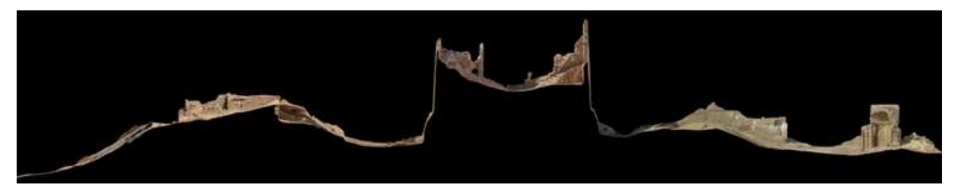
Figure 10. East-West Section of the Fortified Settlement.