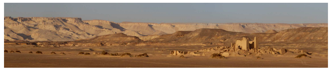
Figure 1. Panorama of Umm el Dabadib.

The paper describes the survey activities of the late Roman archaeological site of Umm al-Dabadib (Egypt). The interesting casestudy can be taken as an example in case of emergency surveys, as this method allows the complete 3D acquisition of a vast and complex area in a very short time and with the aid of simple instruments.