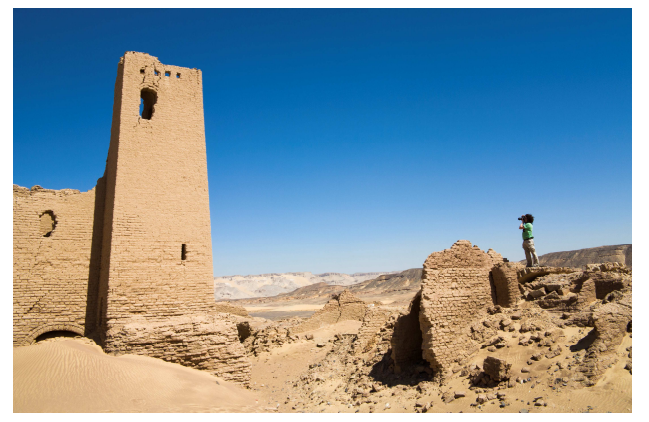
Figure 2. The photogrammteric survey of the castle tower.

Umm al-Dabadib is now the focus of a specific project named OASIS (Old Agricultural Sites and Irrigation Systems), born as a spin-off of NKOS. The scope of OASIS is to study in parallel two sets of contemporary remains: the Fortified Settlement and the agricultural system. Planned, designed and built to work together (one could not exist without the other), they represent a unique chance to investigate the foundation of a self-sufficient installation in a harsh and semi-desert area. Moreover, the study of this site is also likely to yield significant information on the Late Roman policy and strategy of control and defence of Egypt's desert frontiers (Rossi 2013).