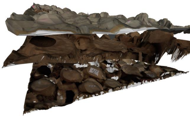
Figure 12. All three layers (US) are represented in the same reference system after the excavation.