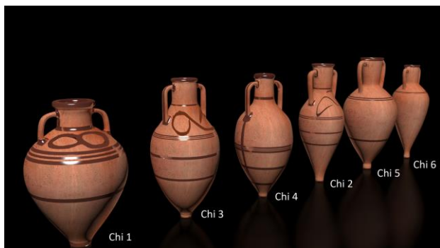
Figure 3. A group of Chian amphoras from 650-600 BC.

Its arched handles are attached to the body as well as the squat neck. A glaze circle band encircles each junction. Most of the Chian amphoras of this period had glaze bands around their rims as well as along the neck-shoulder binding. In some cases there were even diagonal glaze bands or intersecting diagonal glaze bands. Figure 3 shows a group of Chian amphoras from 650-600 BC.