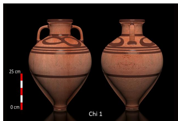
Figure 2. 3D model of a Chian amphora from 650 BC.

First examples of a unique Ionian amphora type began to appear in the second half of the 7 th century BC. They had originated from the workshops of either Chios or Clazomenai. Throughout the archaic period both Chios and Clazomenai were the most prolific amphora production centres of Ionia. A number of vessels had been extricated from sea bottom or unearthed which are dated to a span of time from mid 7 th century BC to early 5 th century BC. These vessels kept their salient typological and decorative characteristics over two centuries which made them recognizable without toil. However, these characteristics had undergone some variations over the time. The manufacturers in both cities seem to have had spent efforts to create amphora styles which help identify the city where they came from. Subsequent to the discovery of a unique amphora type on a Chian coin V. Grace (Grace, 1979) identified a group of ovoid shaped clay jars as Chian amphoras at the beginning of 1930's. This type is known for the \Lambda motives on the shoulder. Figure 2 shows the 3D reconstruction a Chian amphora which is dated to 650 BC. It has a bulbous bellied body decorated with four horizontal glaze bands. Three of these bands stay closer to each other and form a group just under the \Lambda motive, whereas the fourth one stands alone in the middle of the belly.