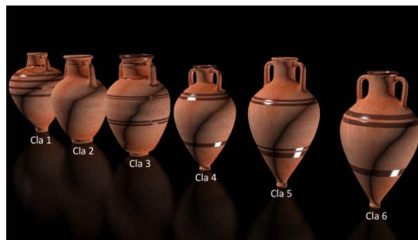
Figure 5. A group of Clazomenian amphoras from 650-600 BC.

Ionian amphora production in the Archaic Period. In his book Y. Sezgin (Sezgin, 2012) provided a catalogue of these amphoras.