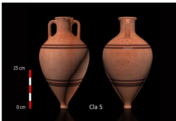
Figure 7. A Clazomenian amphora from the same period