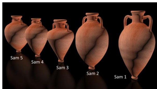
Figure 13. A group Samian amphoras from 7 th -5 th century BC.

A tendency towards a narrower and taller type can be seen here compared to the earlier types which are shown in Figure 13.