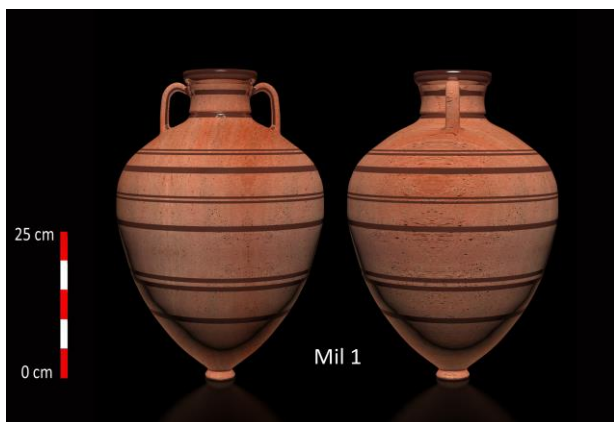
Figure 10. A Miliesian amphora from 6 th century BC.