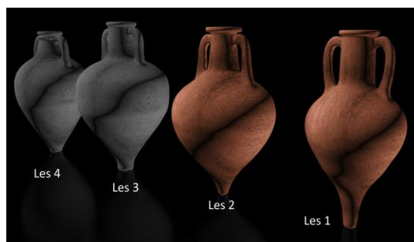
Figure 9 Two red and two grey Lesbian amphoras from the period 7 th -5 th century BC

The grey amphora which started to take place in the scene of commerce as of the middle of the 7 th century continued to dominate the markets till the middle of the 5 th century.