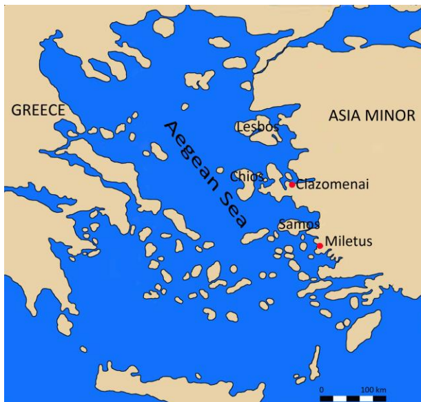
Figure 1. Ionian centers of amphora production in the Archaic Period