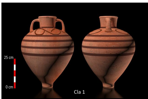
Figure 4. 3D model of a Clazomenian amphoras from 650 BC.

Clazomenia was an important port of wine trading. Clazomenian amphora manufactures in the second half of the 7 th century used the same decorative schemes as Chians. Similar embellishment themes of \surd motives on the shoulder, and horizontal glaze stripes around the rim, shoulder and belly were also implemented by Clazomenian masters. (Figure 4). This made it difficult to separate one from another. However, most of the times these stripes were broader than the Chian counterparts. That's why some authors called them as 'amphoras with broad bands', (Zeest, 1960).