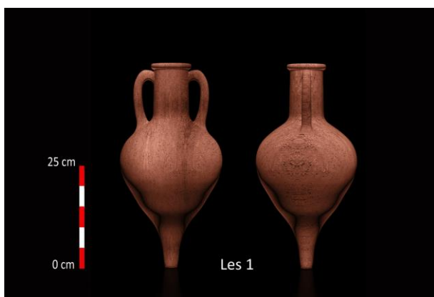
Figure 8. A red Lesbian Amphora which is dated between the last quarter of the 6 th century and the 1 st quarter of the 5 th century.

Earliest red Lesbian amphoras did not appear before the last quarter of the 8 th century BC. From 6 th century onwards both grey and red Lesbian amphoras followed the same lines of development in shape. Red Lesbian amphoras ceased at the end of the 5 th century BC. However, grey Lesbian amphoras continued until the 3 rd century BC. Figure 8 depicts a red Lesbian amphora from an epoch between the last quarter of the 6 th century and the 1 st quarter of the 5 th century.