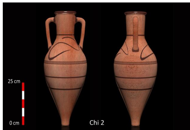
Figure 6. A Chian amphora with a slender and tall body from 575-550 BC.

Starting from the the 6 th century B.C. Chian and Clazomenian amphoras had begun to drift away from each other. Afterwards, Chian and Clazomenian products could easily be separated from each other. Clazomenians ceased using the \surd figure on the shoulders of their vessels, from then on \surd figure was only implemented by Chians as an identification mark. Although Chians had kept \surd figure they made other distinctive changes in both shape and decoration.