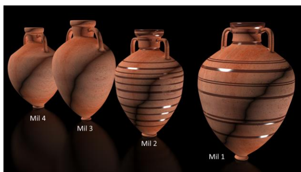
Figure 11. Miliesian amphoras from 7 th -5 th century BC.