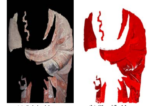
(a) Original Image (b) Classified Image Figure 2 . Classification in red regions.

influence of the environment should be taken consideration into the colour aging model. We use weight to measure the impact of environment. Given the variable time (t in Equation 1), weights are set up according to the image regions of red discolouration. Then the recognition of varying degrees of red discolouration is the following operation to simulate the environmental effect. In order to avoid the joint pixels and overlap caused by further segmentation, supervised classification is adopted to sort the red image regions into three categories which represent the degrees of environmental impact. The classification is performed by the differences between the visual effects of these red regions. Then, the weights are signed to regions of three classes. Figure 2 displays the inversion of discolouration improved with the weight colour aging model. In Figure 2, large effect is put to the dark red regions, while the light red regions get less effect. Figure 2 also shows that the results of reclassification are close to the discolouration in the term of visual effect.