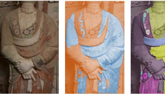
(a) Original Image (b)GrabCut (c)Watershed Figure 1 . Texture image segmentations is acquired with GrabCut and Watershed algorithms.

In this paper, two image segmentation algorithms, namely GrabCut and Watershed. Figure 1 shows the image segmentation processed by the two algorithms.