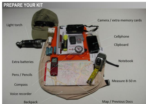
Figure 5. Basic kit for emergency documentation. Such kits were constructed during the courses. An important aspect of this was to have backup documentation tools, techniques and systems (Eppich and Almagro Vidal, 2013).

4.5.2 Step 2: Understand and plan upon arrival. Once the situation permits on the ground documentation some key rules were established to keep the process consistent and systematic: