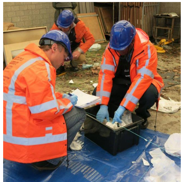
Figure 2. Rapid documentation and inventory exercise during an emergency simulation at an ICCROM First Aid course (ICCROM, 2015)