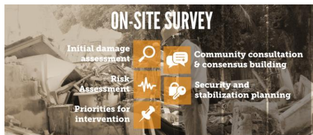
Figure 6. On-site survey was stressed at other points in the course (ICCRUM, 2015)