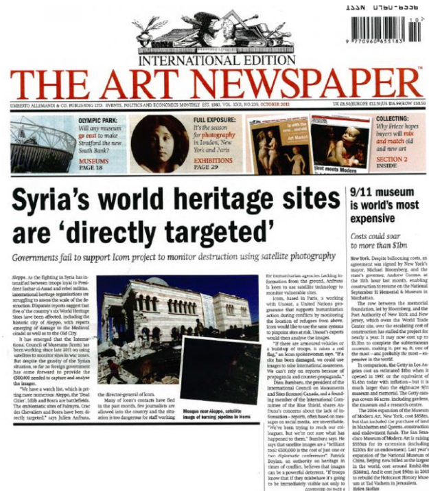
Figure 1. Documentation for cultural heritage sites at risk also includes collecting secondary sources of information from newspapers, social media and other digital content.

People suffer greatly during conflicts and natural disasters. The loss of life, dissolution of families and the rifts in society are atrocious. During such times it is the human needs that prevail and must be addressed – first aid, security, food and shelter. With this in mind there must also be a view to the future – to begin mending the connecting fabric of society, provide hope and a connection to the past as well as address economic possibilities through preserving and restoring cultural sites and institutions. Throughout the world there are a large number of Cultural Heritage places that have been damaged through armed conflicts, looting and vandalism, including, Syria, Iraq, Afghanistan, Mali, Bosnia & Herzegovina, Yemen, etc. etc. The list is very long indeed.