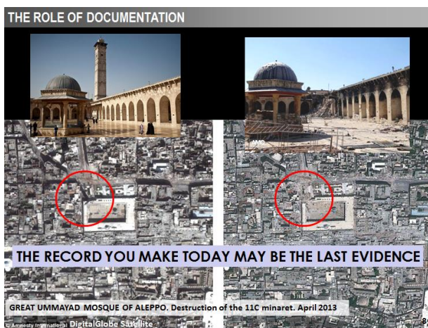
Figure 3. Image before and after recent destruction in Aleppo, Syria with satellite imagery below

In order to address the special situation with documentation and immovable cultural heritage in crisis the course module from the FAC course is presented here. This information has been taken from numerous courses – ICCROM ARIS courses (Architectural Records, Inventories and Information Systems for Conservation), CIPA courses and other university courses held at the University of Granada, KU Leuven and University of Pennsylvania (Eppich and Almagro Vidal, 2013) but it has been adapted for the special situations surrounding sites in conflict areas. Throughout the courses it was emphasized that the record the participants were making could be the last evidence of Cultural Heritage (Fig. 3). It was stressed that this was of utmost importance and therefore certain principles and guiding principles should be followed.