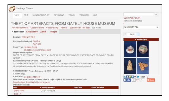
Figure 1: Example of a heritage crime case on SAHRIS

Once digitised, these objects can then be linked, through the creation of a Heritage Crime Case application, to the details of the crime perpetrated. The case also captures, and links, the repository from which they were stolen and its geographical location as well as all role players involved, be they government heritage officers; museum officials; heritage practitioners; local and/or international law enforcement officers; art dealers; Customs Officials and the public.