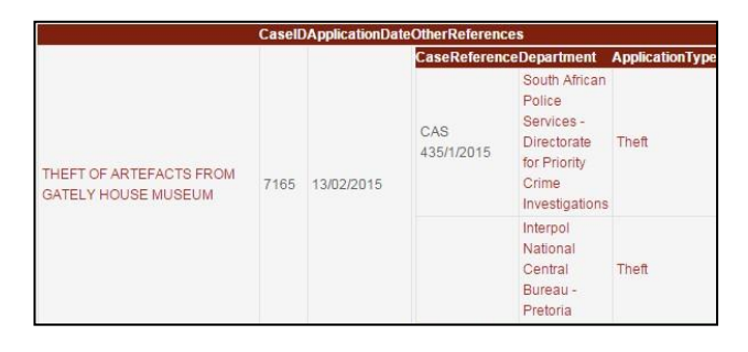
Figure 2: Example of police officer's dashboard

Once digitised, these objects can then be linked, through the creation of a Heritage Crime Case application, to the details of the crime perpetrated. The case also captures, and links, the repository from which they were stolen and its geographical location as well as all role players involved, be they government heritage officers; museum officials; heritage practitioners; local and/or international law enforcement officers; art dealers; Customs Officials and the public.