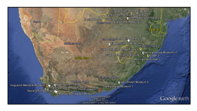
Figure 4: Mapped incidences of heritage crime in South Africa indicating location of crime and number of incidences

While, as has been indicated, heritage crimes are not captured separately from other kinds of crimes, SAPS does record "hot spot" maps of crime across the country (Benson, 2013). The built-in mapping function of SAHRIS and the capacity to generate GIS overlays means that locations of crimes captured and mapped on SAHRIS can be measured against the SAPS "hot spot" maps.