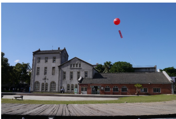
Figure 8: Taipei Huashan 1914 Creative Park.

Maintaining cultural diversity is a universal value, and intangible cultural heritage preservation reflects cultural diversity. The advent of the 2001 Universal Declaration on Cultural Diversity, the 2003 Convention on Intangible Cultural Heritage, and the 2005 Convention on Cultural Diversity demonstrated the importance of intangible culture heritage to the international community. Since 2005, Taiwan's heritage preservation policy has followed the international trends, and Article 1 of the Cultural