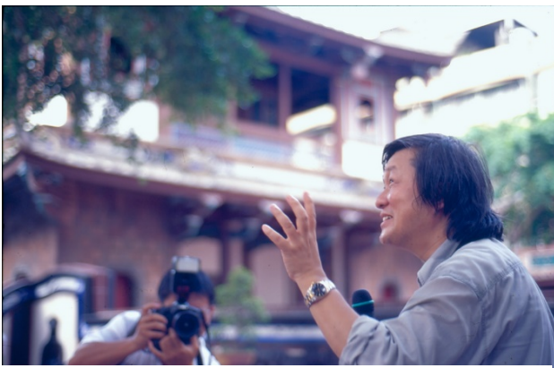
Figure 1: Professor Gan-Lang Li.

In the 1980s, two major events occurred in Taiwan's cultural circles: firstly, the establishment of Council for Cultural Affairs and secondly, the promulgation of the Cultural Heritage Preservation Act. The former marked the first central cultural affairs dedicated ministry for the nation, representing that the country has begun to pay attention to its cultural needs. The latter is Taiwan's first cultural act promulgated to provide the legal authority required to implement the historical monument preservations that were badly needed at the time. However, Taiwan's monument preservation movements in the 1970s are the primary impetus that give rise to the institutionalization of heritage preservation.