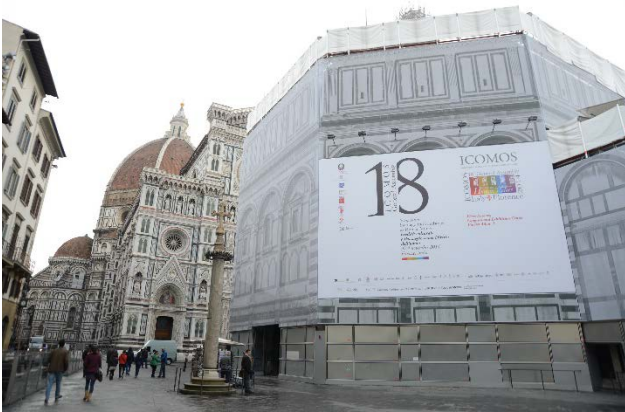
Figure 11: 2014 Declaration of Florence indicated that heritages has the power to drive urban redevelopment.

not only increased the visibilities of Taiwan's international heritage preservation organizations, it also opened up the modern post-World War II architectural heritage preservation topics as well. Monuments in Taipei, such as the Chiang Kai-shek Memorial Hall, Yangmingshan Zhongshan House, and the Mosque are subjects that the Docomomo International is currently committed to preserve. On March 30, 2015, Taiwan and AusHeritage have signed the Memorandum of Understanding (MOU) on cultural heritage cooperation to work together on cultural initiatives such as underwater archeology and preservation techniques.