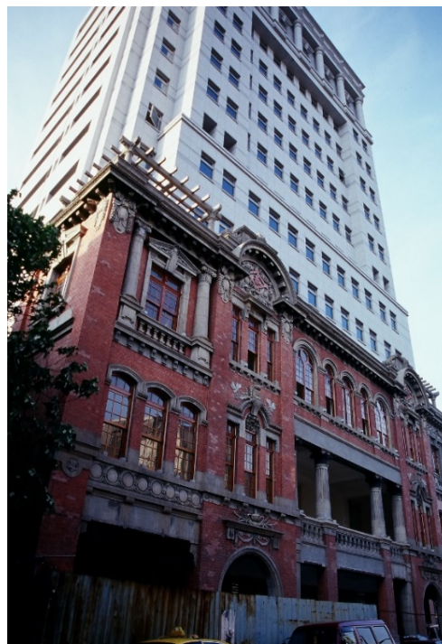
Figure 5: The estate owners can through the TDR to acquire the original development rights. It is a famous case, Ye’s house, at Dadaocheng area in Taipei city.

responsible to review and designate historical monuments. Since then, various county and city governments have started to designate Japanese colonial buildings as monuments because the law has relaxed, which caused the quantity of monuments to dramatically increase. Furthermore, because the historical value determinations of the monuments have been decentralized locally, the substances of the historical monuments started to resemble more closely the local context. The categories of preservation also no longer focused on the design appearances, the artistic aesthetics of the façade, or long lasting historical values. The questions of monuments can highlight local culture and invoke