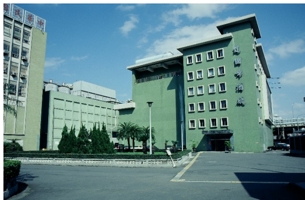
Figure 9: Taipei Jianguo Brewery was the first beer factory in Taiwan history, as known as a famous industrial heritage.