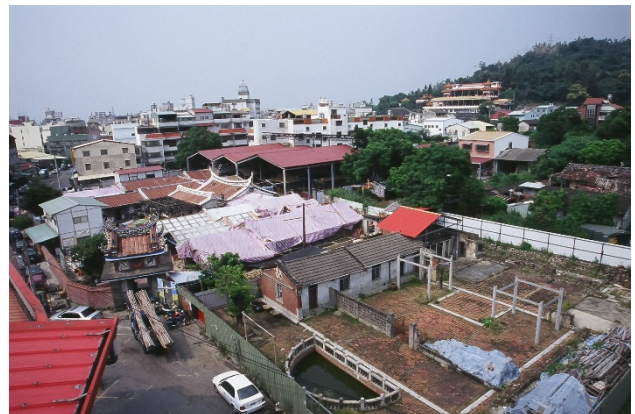
Figure 7: Sept. 21, 1999, most of the historical buildings of Lin Family in Taichung had toppled during the great earthquake.

Prior to 2000, Taiwan's monument preservation principles often contradict those provided by the Athens Charter or Venice Charter. For example, the monument reparation process ignored the "reversibility, identifiability, and non-speculation" principles. The Venice Charter emphasizes that daily maintenance is the most critical work, but Taiwan did not standardize the routine monument maintenance operations. In addition, Taiwan referenced the European experiences and added the "historical building" category as well as the "historical building registration system" in order to prevent historical value buildings from being demolished during a disaster relief processes.