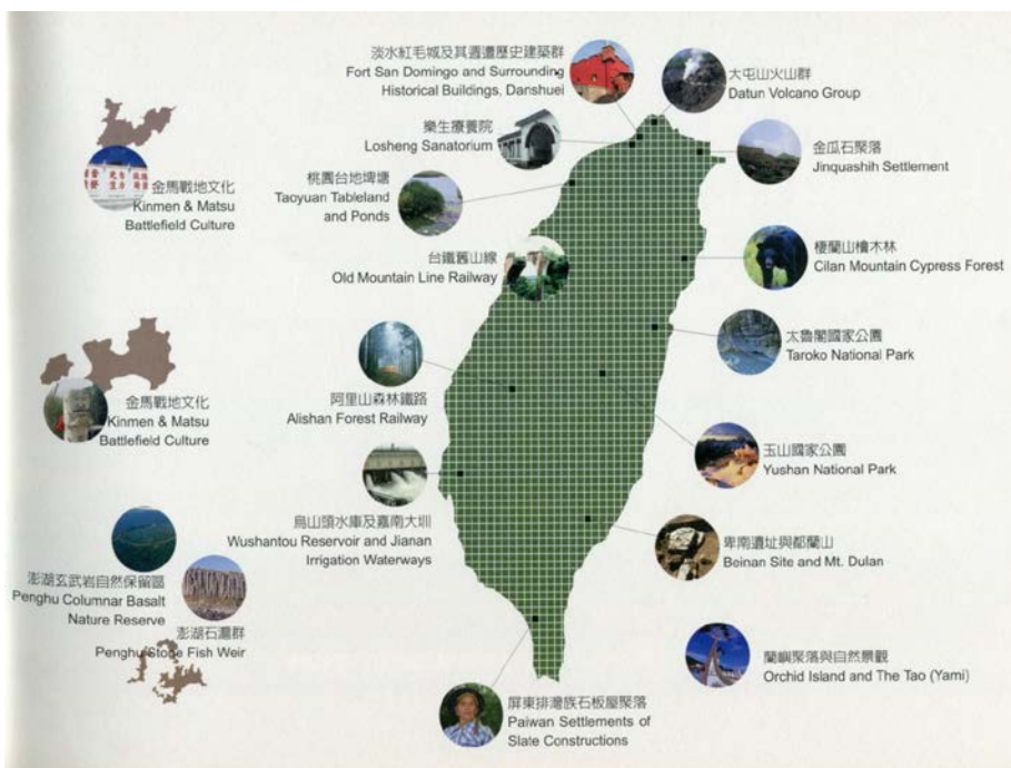
Figure 10: The Taiwan 18 Potential World Heritage Sites Plan.