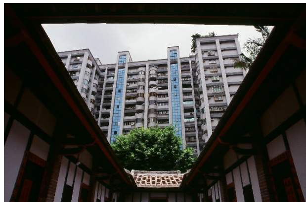
Figure 4: The Lee Family’s House in Luchou District has been a well known historic site in New Taipei City.

In May of the same year, the monument designation review authorities were given back to the local governments, which changed the previous practice where the central government was