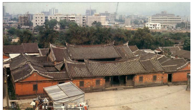
Figure 2: The Lin-An-Tai historic building in 1977.