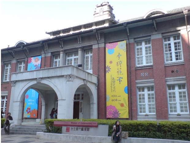
Figure 6: the Taipei City Museum of Contemporary Arts.

As the number of monuments continued to increase, the preservation must further consider how the monument can be returned back to the people's lives. Sustainable development can only be achieved by turning monuments into indispensable parts of modern society like banks, schools, or restaurants. Monuments must also regain their operational energy and value for existence through reuse. Therefore, Cultural Heritage Preservation Act proposed for the first time that monuments may adopt different methods of reuse according to their features. In the 1990s, numerous monuments were turned into museums, exhibition halls, restaurants, or coffee shops as they can be reused and preserved. Examples include the Taipei City Museum of Contemporary Arts (Figure 6), the Taipei Wistaria Teahouse, and the Kaohsiung Museum of History.