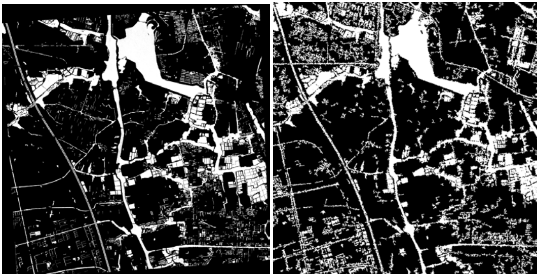
Figure 2. Closed regions extraction results