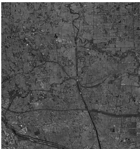
Figure 2. The panchromatic image of Beijing-1 small satellite(P1)

To test the algorithm's parallel performance, some images of Beijing-1 Micro-satellite with different size are used to test on different number of computers. Table 1 gives the cost time and parallel efficiency of fusion for images of Beijing-1 Micro-satellite with different size on 1,4,8 and 16 computers respectively. The experiment results show that good result of fusion can be obtained quickly with the new method. On the other hand, the algorithm's parallel performance is affected by the time of data transfer, the time can be reduced by improving the network bandwidth. By the analysis of the relation between the efficiency of the new method and network bandwidth, it is discovered that the network bandwidth has effect on the efficiency, the wider the network bandwidth, the higher the efficiency, and the better the extensible function.