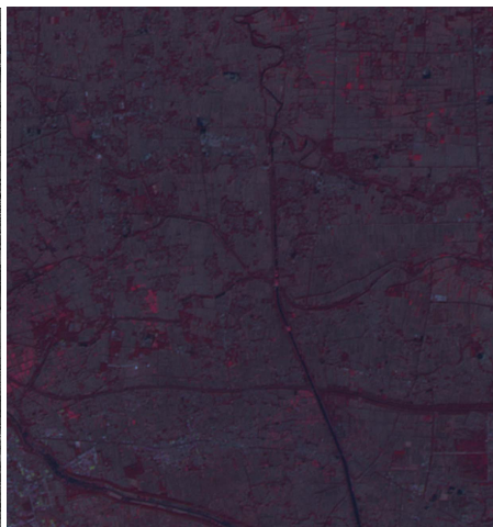
Figure 3. The multispectral image of Beijing-1 small satellite(M1)