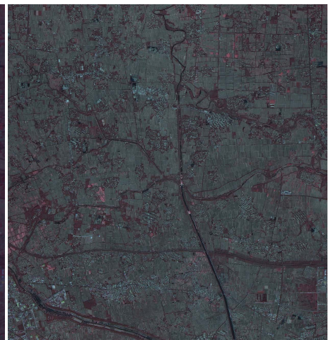
Figure 4. The fusion result image of Beijing-1 small satellite with the proposed method of image fusion in the paper(F1)