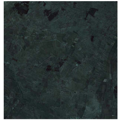
Figure 7. The fusion result image of Beijing-1 small satellite with the proposed method of image fusion in the paper(F2)