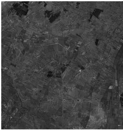
Figure 5. The panchromatic image of Beijing-1 small satellite(P2)