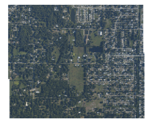
Figure 6. Images after color matching