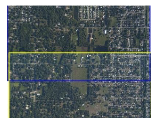
Figure 5. Images before color matching

computation uses one of the three matching options: histogram matching, statistics matching and linear correlation. Once the transformation formula is calculated, all pixels in the source image will be transformed to match the target. Figure 5. shows the source data before color matching and Figure 6. shows the same data after color matching. The top data is to be matched to the bottom image which is the reference data.