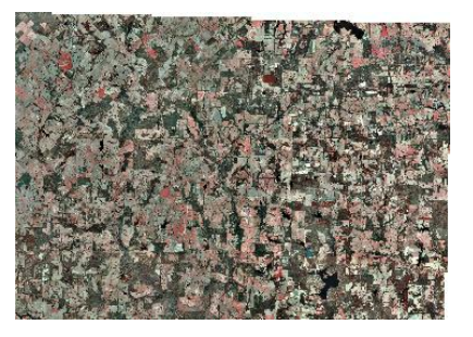
Figure 4. Images after color balancing

When the images in an image collection overlap with adjacent images, color matching technique can be deployed. Color matching simply uses the overlapping pixels to compute color transformations from source image to target image. The