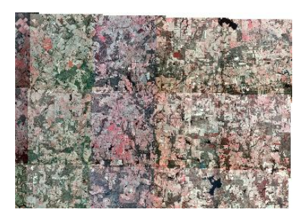
Figure 3. Images before color balancing

Color balancing is the process to change each pixel value to match a target color surface. Dodging balancing uses traditional photogrammetric dodging algorithm to change each pixel value to target color derived from target color surface. Depends on the size and variations in the source data, there are five target color surface to choose from, single color, color grid, first order surface, second order surface and third color surface. Target color surface can either be generated from the source data or derived from a target dataset. Other balancing methods change pixel values according to the statistics distributions of the target data source, for example histogram balancing and standard derivation balancing. Figure 3. shows the mosaic dataset with images of different color tones and Figure 4. shows the same mosaic dataset after applying color balancing.