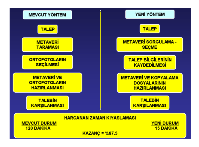
Figure 11. Time comparison of the metadata inquiry and registry

study, the process of the meeting demand is implemented as; request, inquiry and selection of the metadata, registry of the requesting information, preparation of metadata and copy files and delivery, and all this process lasts 15 minutes (Figure 11).