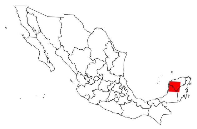
Figure 1. Study areas: the national terrestrial territory of Mexico with its states and location of Landsat path-row 046-020 on the Yucatan peninsula, marked in red.

In a first test, the national terrestrial territory of Mexico (1.972 Mio km<sup>2</sup>) will be analyzed using MODIS data. Next, the area of path-row 046-020 will be studied in detail (Figure 1) using Landsat and MODIS-based change detection products. This region, located in the north-western portion of the Yucatan peninsula and south of the city of Merida, depicts a transition from deciduous to evergreen broadleaf tropical forests towards the East. Slash-and-burn agriculture, such as frequently applied to Milpas, is characteristic to fertilize poor karstic soils for a short period of 3-5 years, planting maize, squash, and beans.