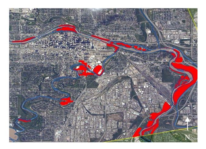
Figure 5. ISERV scene used to map flooding in Calgary, Alberta, Canada on 22 June 2013. Red areas are flooded.

ISERV was developed to support a joint NASA/US Agency for International Development (USAID) project known as SERVIR. The word "servir" is Spanish for "to serve". The SERVIR project (http://www.nasa.gov/mission_pages/servir/) provides satellite data and tools to environmental decision makers in developing countries and operates via regional "hubs" in Nairobi, Kenya; Kathmandu, Nepal; and Panama City, Panama. ISERV's primary targets are areas threatened by or already experiencing floods, landslides, forest fires, or other disasters. The images can be used to monitor events, evaluate damage extent and direct evacuation and disaster relief efforts. The ISERV has also provided useful data for IDC response, and other calls for imagery from the ISS to support ground relief and recovery efforts (Fig. 5).