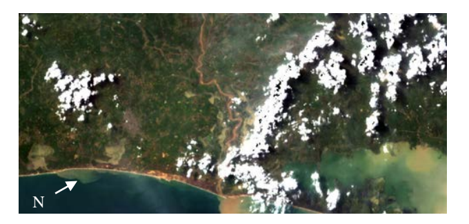
Figure 4. Subset of HICO scene acquired on 16 October 2013 in response to IDC activation for flooding in India following Tropical Cyclone Phailin.

The sensor system was mounted externally on the Japan Experiment Module Exposed Facility (JEM-EF) which provided nadir viewing opportunities. The HICO could also point crosstrack 45 degrees to port and 30 degrees to starboard. Following completion of Navy goals for HICO in late 2012, NASA assumed sponsorship of the sensor to continue its operation on ISS. As such, the HICO also became a participating sensor for IDC activations (Fig. 4). The HICO dataset is available from maintained by Oregon State websites University (http://hico.coas.oregonstate.edu/; original data cropped to 87 bands) and the NASA Goddard Space Flight Center's OceanColor Web site (http://oceancolor.gsfc.nasa.gov/cms/; full 128-band data).