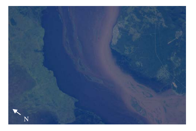
Figure 3. Astronaut photograph ISS036-E-34510 acquired on 21 August 2013 in response to IDC activation for flooding of the Amur River in eastern Russia.

The presence of astronauts on-board the ISS allows for a "serendipity factor", in that the crew can observe a developing event from orbit and collect data immediately, without requiring direction or upload of targeting instructions/commands from a ground system. The Crew Earth Observations ground support team also provides specific targeting information to the crew for official IDC activation targets (described in section 3.0 below). A disadvantage of handheld digital imagery from the ISS is the lack of native geolocated by hand using other georeferenced information such as Google Earth imagery or Landsat data. This limits the immediate usefulness of CEO data for disaster response, however it has also been the only data collected from the ISS for some IDC events under the best-effort paradigm.