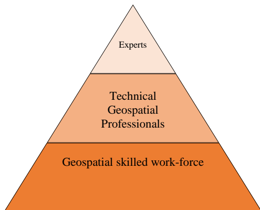
Figure 1 Geospatial Professional categories

– who have a graduate/ masters degree in geospatial technology form the “pyramid top” of the workforce. These would be the project managers who are capable of handling geospatial projects independently.