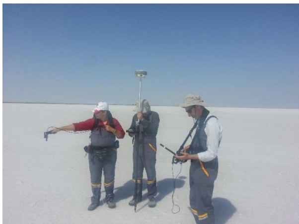
Figure 1. Surface reflectance measurements

pressure and humidity needed for 6S input. Ozone measurement at Tuz Gölü is also available on NASA’s website. In addition, SATLAB SL600 was used the GNSS data for localization. The image of the collection of the field spectra can be seen on Figure 1. The image of the sun photometer and the meteorology station can be seen on Figure 2.