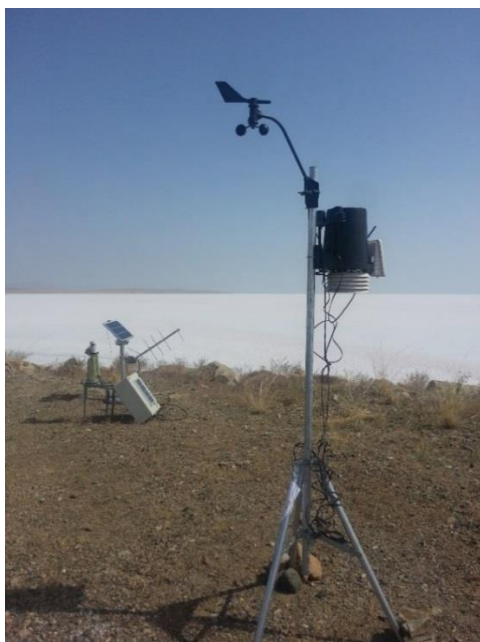
Figure 2. The sun photometer (left) and the meteorology station (right) used at Tuz Gölü September 2015