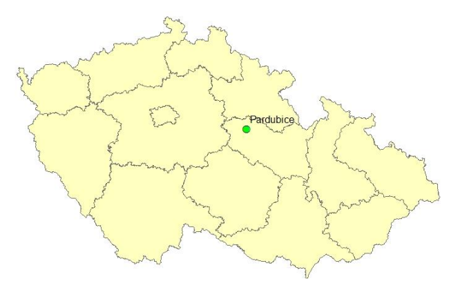
Fig. 3: Placement of the city of Pardubice in the Czech Republic

Area of interest is located close to the city of Pardubice, in the Czech Republic. The case study studies part of a shoreline of the Pohranov pond, close to the municipality of Pohranov (see Figure 3.). Size of the pond is 0.4 km<sup>2</sup> (Pardubický kraj, 2015).