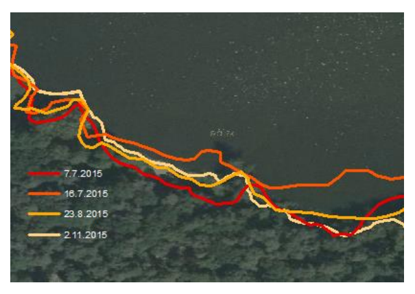
Fig. 5: Define shorelines for every monitoring

are manually created in a form of new shapefiles (see Figure 5).