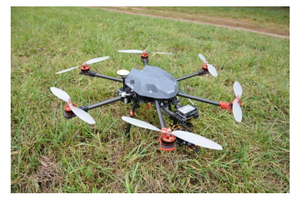
Fig. 4: UAV used for monitoring pond Pohranov

UAV provides data in necessary high distinction and costs are also lower. Tarot 690 is used for monitoring pond Pohranov. It can be characterised as follows: airscrew gear; 6 gears; 0.985 m average of impeller; 0.35 m height, 70 km/h maximum speed. This UAV has the following restrictions (conditions under which it cannot be used): temperature under -10 °C; wind fasters than 10 m.s<sup>-1</sup>; fog with visibility under 100 m; creation frost on the airscrew; drizzle, rain and snowfall. Figure 4 shows the UAV used for monitoring Pohranov pond.