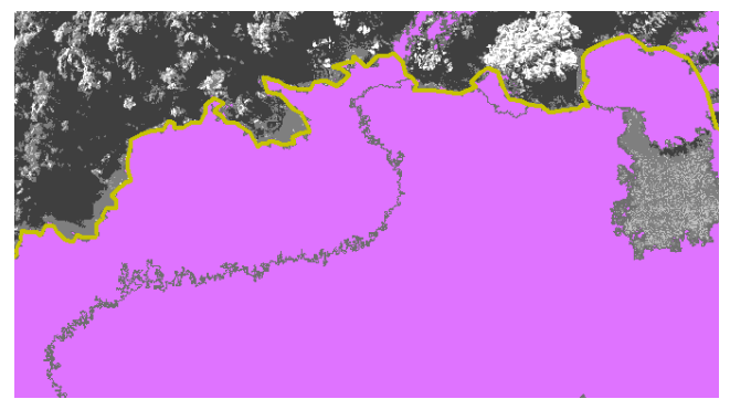
Fig. 6: Supervised classification in 7.7.2015

Extension of ArcGIS for Desktop – Image Analysis, is used for studying shoreline, and particularly their changes. This extension is used as a tool for supervised and unsupervised classification also. Supervised classification (Seed tool) and next creating polyline is available (see Figure 6). Unsupervised classification is available in the way shown by Figure 7. An approximate scale of figures 5,6 and 7 is 1 : 785 000 000. Next, resulting polygons are converted into polylines. Polylines must be repaired in both cases because shadows are visible in the images. Irregular texture is visible in both images. It decreases quality of classifications. In this case images must be repaired by observer. So, polylines created by observer are used for the following calculation of indices (Figure 5).