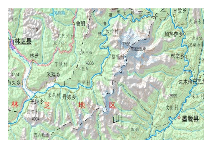
Figure 2. Small sample plot of 1:1000000 topographic map