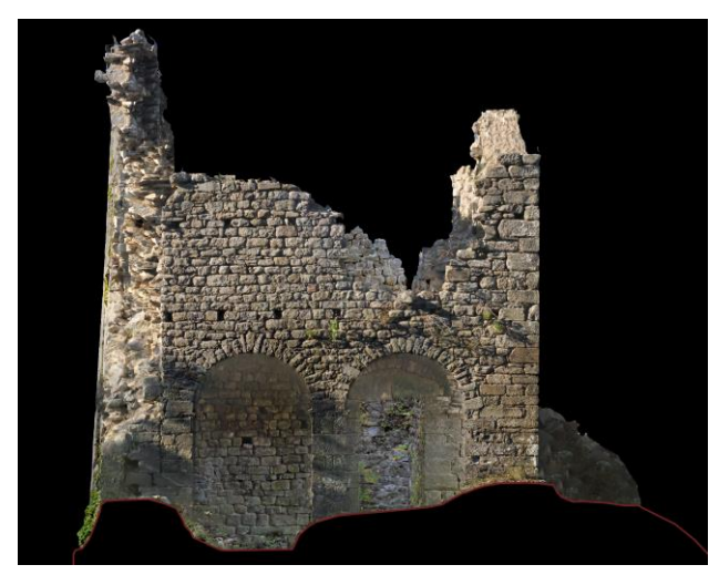
Figure 9. Orthophoto of the Castle.

integrated with a TLS and terrestrial photogrammetry survey (Figure 8), the latter much faster (and consequently much safer), as far as data acquisition time is concerned.