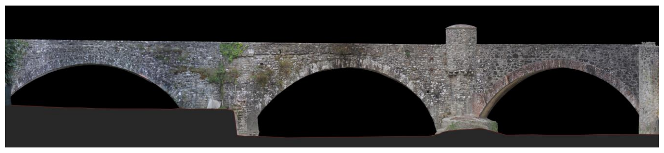
Figure 7. Orthophoto of the bridge.

The International Archives of the Photogrammetry, Remote Sensing and Spatial Information Sciences, Volume XLI-B5, 2016 XXIII ISPRS Congress, 12–19 July 2016, Prague, Czech Republic