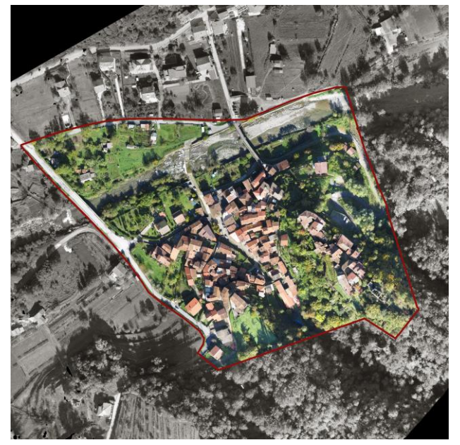
Figure 5. Orthophoto with the survey area highlighted.

On the basis of these GCPs the photogrammetric survey of the village was carried out. Due to the small size of the area under investigation (ca. 380 x 280 m) and the need to complete the survey in short time and with low cost, a UAS survey seemed to be the optimal solution. The drone used was the fixed-wing Swinglet CAM produced by SenseFLY. It is particularly functional because, being realised in Expanded Polypropylene (EPP) foam and carbon structure, it is very lightweight which makes it able to fly up to 30 minutes with a single battery and so, in this case, to complete the planned mission with just one flight. The Swinglet CAM was equipped with a Canon IXUS 125 HS camera with 4 mm focal length optics (35 mm equivalent focal length is 24 mm) and a resolution of ca. 16 Mpixels. Unfortunately, previous experience showed that often the quality of the images acquired by this platform is not optimal if compared with higher quality but heavier cameras. During the flight planning, this issue was taken in consideration opting for a much smaller GSD than the one strictly required for the desired mapping scale (1:500).