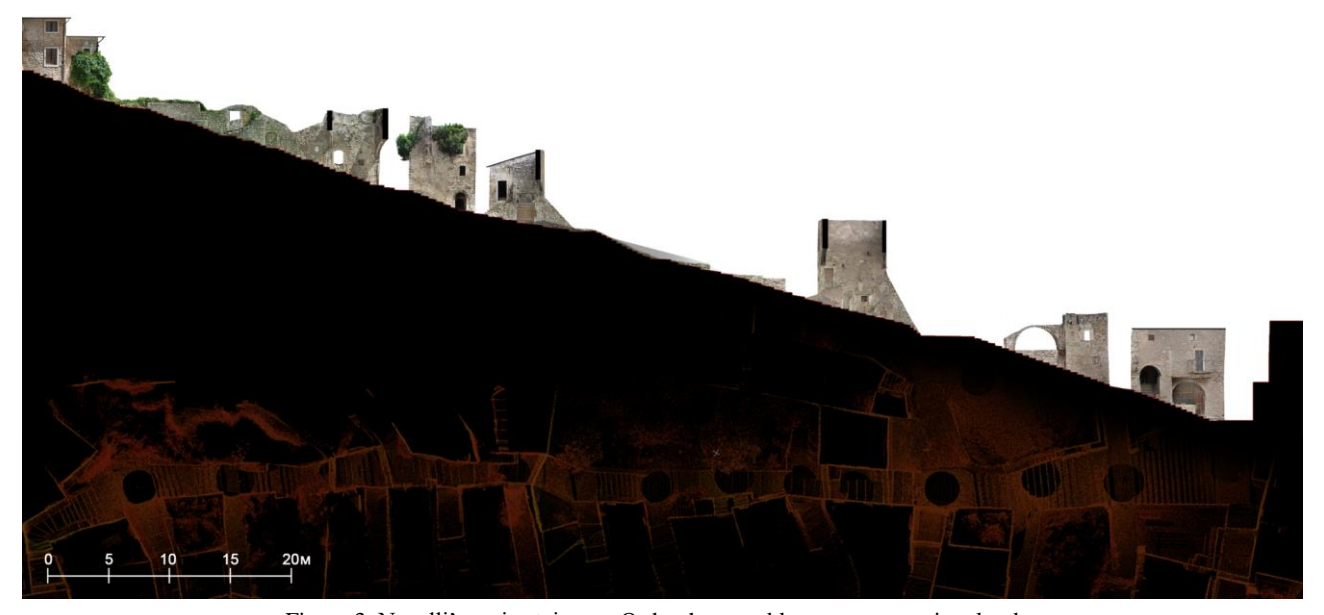
Figure 3. Navelli's main staircase. Orthophoto and laser scanner point cloud.

The TLS survey was performed with a Leica C10 time-of-flight Scan-station. The staircase is made of sections of different slope