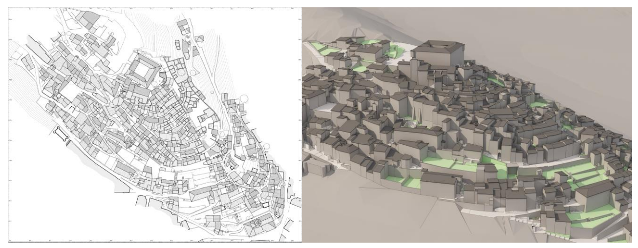
Figure 2. Cartographic restitution and general view of the 3D city model.

The International Archives of the Photogrammetry, Remote Sensing and Spatial Information Sciences, Volume XLI-B5, 2016 XXIII ISPRS Congress, 12–19 July 2016, Prague, Czech Republic