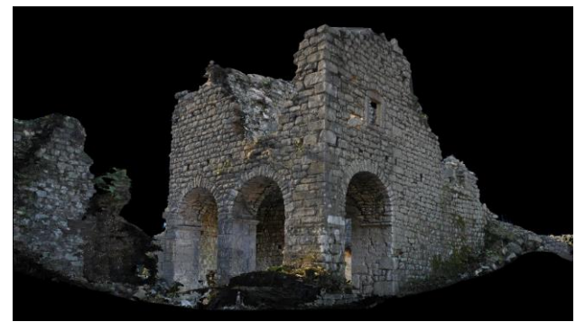
Figure 8. Castle photogrammetric model.

As already mentioned, the castle is in ruins, with many collapsed parts reduced to heaps of stones. Performing a complete and time consuming direct survey with tapes and range finders of the less damaged parts was dangerous for the safety of the surveyors, due to the precariousness of the structure. So, as far as the architectural survey is concerned, the direct survey of the accessible and less unstable areas had been