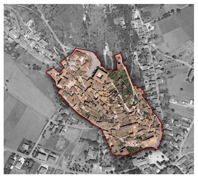
Figure 1. Orthophoto with the survey area highlighted.

In old historical city centres, conservation constraints prevent new constructions and only allow maintenance or reconstruction of buildings: however, in order to increase the appeal of living in the old city centre, renovation and improvements of standards of houses has been foreseen in the plan. To promote joint effort from owners of adjacent buildings, the blocks were divided in smaller sections. Car traffic is not really a problem in the city centre: many streets are too narrow to let them in. To the contrary, carrying heavy goods can be a problem due to fact that most uphill street are realized by stairs