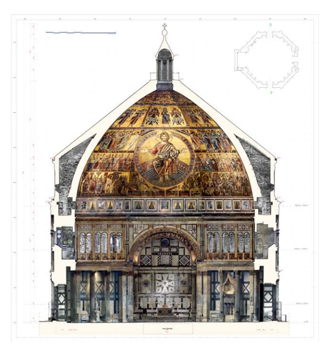
Figure 4. Longitudinal section: vectorial drawing and orthoimage