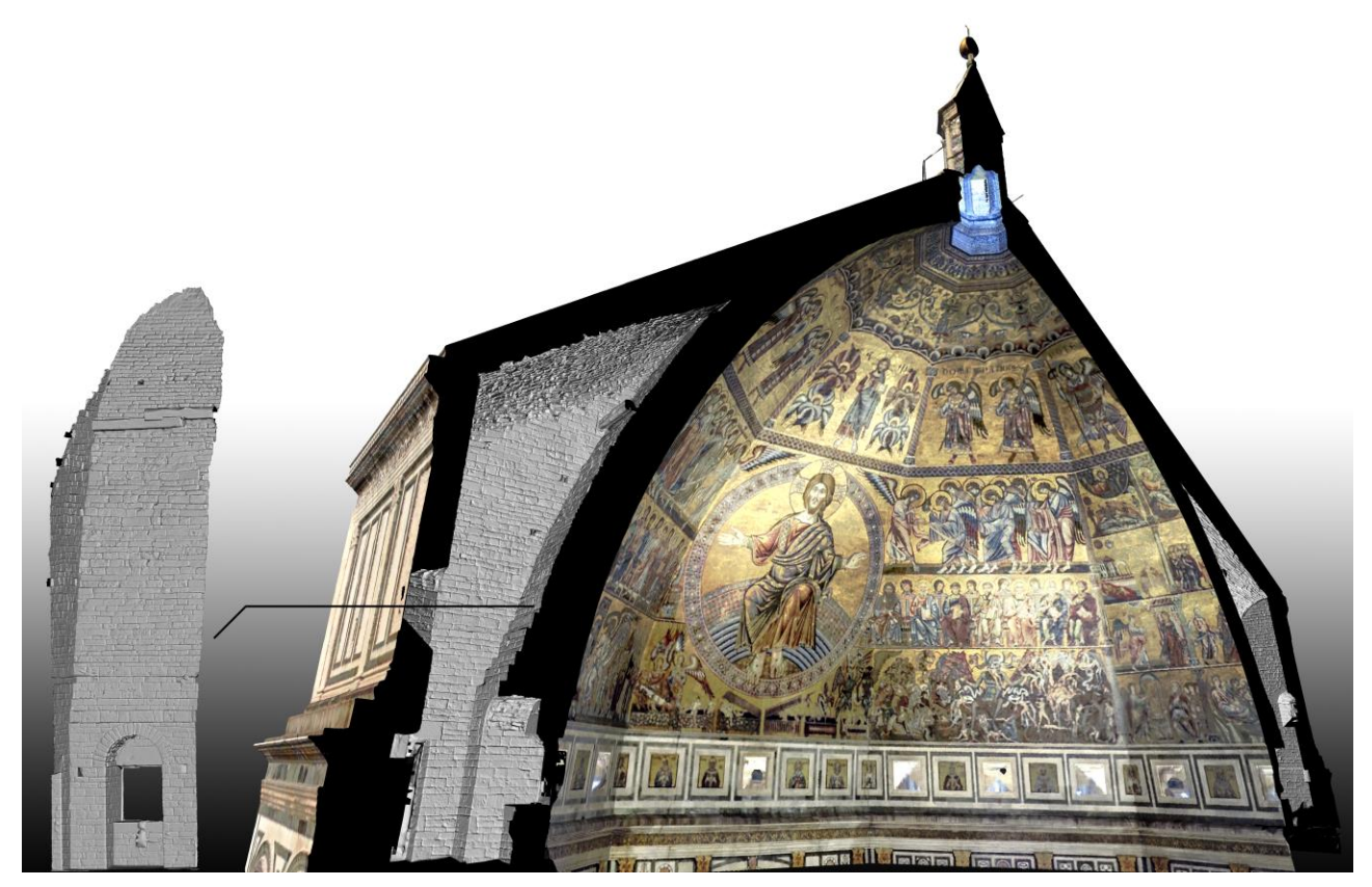
Figure 5. 3D section of the vault.

By looking at the model it is possible to examine the overall layout of the openings – nonetheless these are very evident from the staircase. Some of them face outwards, and others inwards, but they are not visible as they are covered over by the marble facings. Their exact position with regard to the internal space gives rise to questions on what interventions may have modified the internal cladding, and in particular that of the pillars.