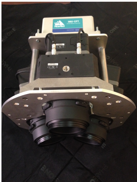
Figure 1: Camera head based on 3 midformat cameras to generate nadir and 2 oblique views

There is also a certain need for such information after e.g. an earthquake in order to analyze the degree of damage on buildings. For this application there is no need of a high geometric accurate sensor, also SLC Camera based Oblique Camera system as the Aero OI N5, which uses Nikon Cameras, do a proper job. From these data, deformation analysis to estimate the remaining building stability can be produced.