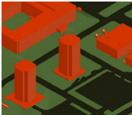
Figure 3: Part of the campus of Université Laval

The study area of the experiments is a part of the campus of Université Laval, located in Quebec City, with a dimension of 300 m by 300 m (Figure 3). For the experiments, 12 sensors have been assumed to be deploying as surveillance cameras with 360 degrees horizontal, \pm 90 degrees vertical sensing angle, and 50 meters of effective sensing range.