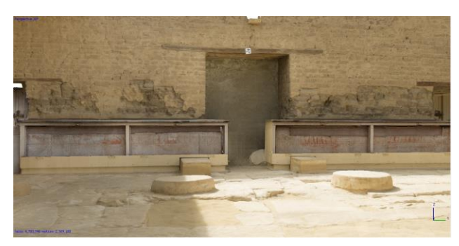
Figure 7. Same view of the 3D model of the tomb of Maya after the digital removal of the wooden lockers (elaboration by F. Fiorillo, 2018).

The 3D surveys and the ensuing models can inspire further considerations. This is, in fact, an ideal case to discuss the possibility to let the virtual realm into the picture, with the task of accompanying the reality. It is not a matter of refusing the reality and 'photoshopping' it to make it look different, but rather of complementing it by revealing what is hidden, and adding what is lost.