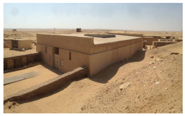
Figure 4. The tomb of Meryneith, encapsulated in a protective structure (photograph by L. Perfetti, 2019)

The second type of intervention has been applied only to the relatively small tombs of Meryneith (figure 4), high-ranking official who lived under the pharaohs Akhenaten and Tutankhamun. Differently from the others, this one was left more or less as it was found when it was unearthed: the protection is entrusted to a masonry coffer that encapsulates the entire tomb (Warner, 2009, 111-112).