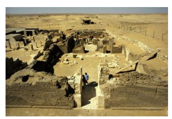
Figure 3. The Tomb of Maya when it was unearthed

tourists, over the years all the excavated tombs have been the subject of significant interventions, including substantial reconstruction of missing parts and addition of protective structures (Warner, 2009).