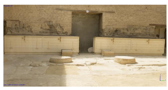
Figure 6. View of the 3D model of the tomb of Maya showing the wooden lockers located in the second courtyard, as surveyed (elaboration by F Fiorillo, 2018).