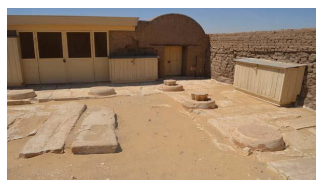
Figure 5. The Tomb of Pay and Raia after the restoration works (from www.sharm-club.com/egypt/ancient-tombs/pay-raia-tomb-saqqara-necropolis).

the chosen solutions represent the best possible practical method to protect the architectural and artistic remains. There are prices to pay, though, and clearly the intelligibility of the tombs at first sight has been somehow lost in the process (figure 5). Currently, only visitors with a previous knowledge of the historical and architectural background of these tombs are able to 'see through' these protective structures, that otherwise tend to take most of the visual scene.