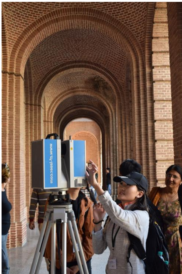
Figure 5. One participant of the “Ground based 3D Modeling (Close Range Photogrammetry & TLS)” tutorial during the surveying activities at the Forest Research Institute of Dehradun

The workshop was entirely organized and taught by four participants to the first training, whom became trainers in turn. This first experience represented an applicative test of the two different aims of this project: on one side an in-depth training for specialized technicians who have to deal with conservation issues and will be future trainers in turn, on the other the transfer of basic concepts about photogrammetry (by focusing on the acquisition phase) to a wider audience in little time.