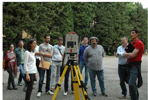
Figure 3. Some activities on the field with a laser scanner during the Advanced Course of the academic year 2014-2015.

Finally, a course has been held also in the Specializing Master School in Archaeology (which lasts two years), Topography and Cartography – Remote Sensing for the environmental archaeology (10 hours) to provide the archaeologists the theoretical basis and skills in the concept of spatial measures with integrated surveying technologies.