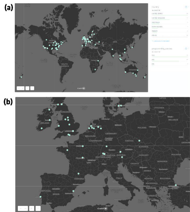
Figure 1. a) The data showed in the map 10 show the distribution of Geomatics BSc and MSc in the world. b) The same distribution in Europe: the absence of specific programmes in Italy is evident.

Chartered Surveyors (RICS) 9 for UK, are devoted to educational activities and capacity building, for accreditation of standards in university programs and the suitability of their offer to sustain the professional needs, respectively (Masum et al. 2017).