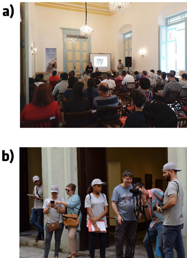
Figure 4. a) The final seminar in Havana after the two-weeks course. b) Surveying activities on the field by using the “learning-by-doing” approach

The two experiences were quite different, since the final purpose of the “INNOVA CUBA - International and intersectoral intervention for the safeguard of the cultural heritage of the country” project is the promotion and use of technological and methodological innovations in the conservation and protection of cultural heritage, to strengthen the touristic offer and the economical and social growth of the Cuban territory 14 (Tucci et al. 2018b).