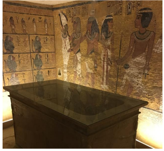
Figure 4. The replica tomb of Tutankhamen at Carter House

the resurgence and renewed favour in replicas happened too quickly and at the expense of a site's other conservation needs? Is technology really being used in the service of conservation and preservation? Or, is it the other way around? Using the example of Tutankhamen's two tombs this paper aims to provoke discussion on these topics and to begin to look at how those working with heritage can balance the benefit of 3D technology and replica creation with the overall conservation needs of a site and where conservators and heritage recording experts can better align their goals and efforts in the interest of preserving cultural heritage.