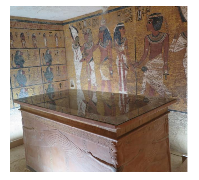
Figure 3. The tomb of Tutankhamen, Valley of the Kings

a few. Today the potential role replicas can play continues to expand to now serve specific conservation objectives ranging from the creation of an archival and documentary record of a site for posterity to alleviating pressure from mass tourism by drawing tourists away from the actual site. The growing prominence and use of replicas in the cultural heritage field urges us to take a more careful and nuanced look at the commissioning, fabrication and application of these objects.