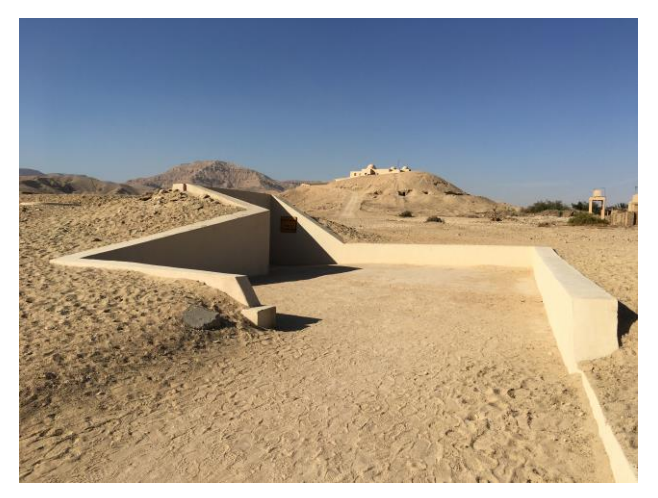
Figure 2. The entrance to the replica tomb of Tutankhamen at Carter House

Has the migration, adoption and reliance of 3D technology and