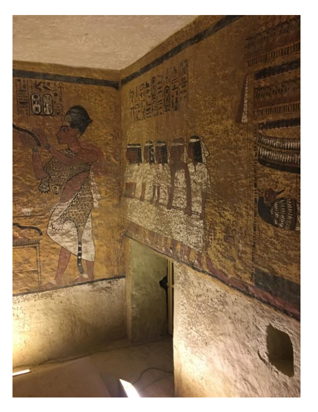
Figure 6. The northeast corner of the burial chamber of the facsimile of the tomb of Tutankhamen

The project by the Factum Foundation for Digital Technology in Conservation, with a team composed of recording specialists, photographers, artists and conservators, aimed to digitally capture the original tomb by using a non-contact, reversible method to preserve the tomb for the future and to produce a high resolution replica. The resulting Tutankhamen replica was part of a larger Theban Necropolis Preservation Initiative