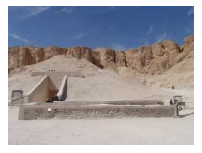
Figure 1. The entrance to the tomb of Tutankhamen, Valley of the Kings

The International Archives of the Photogrammetry, Remote Sensing and Spatial Information Sciences, Volume XLII-2/W11, 2019 GEORES 2019 – 2nd International Conference of Geomatics and Restoration, 8–10 May 2019, Milan, Italy