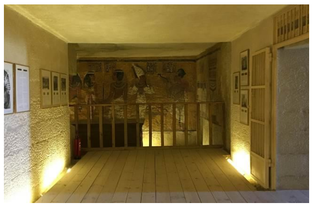
Figure 8. View of the antechamber looking north to the burial chamber in the replica tomb

The Tutankhamen replica is said by Factum Arte to redefine the relationship between originality and authenticity but at the same time it is not trying to deceive the visitor into believing it is the original. Article 13 in the Nara Document on Authenticity lists the various categories on which authenticity can be understood which include form and design, materials and substance, use and function, traditions and techniques, location and setting, and spirit and feeling which retain the cultural significance of