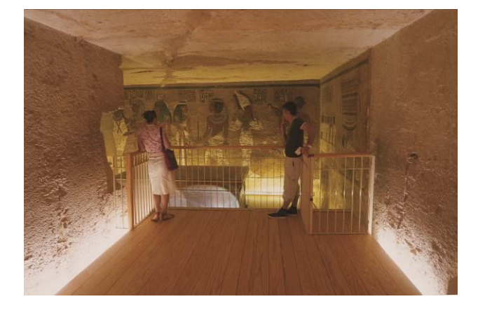
Figure 7. View of the antechamber looking north to the burial chamber

The International Archives of the Photogrammetry, Remote Sensing and Spatial Information Sciences, Volume XLII-2/W11, 2019 GEORES 2019 – 2nd International Conference of Geomatics and Restoration, 8–10 May 2019, Milan, Italy