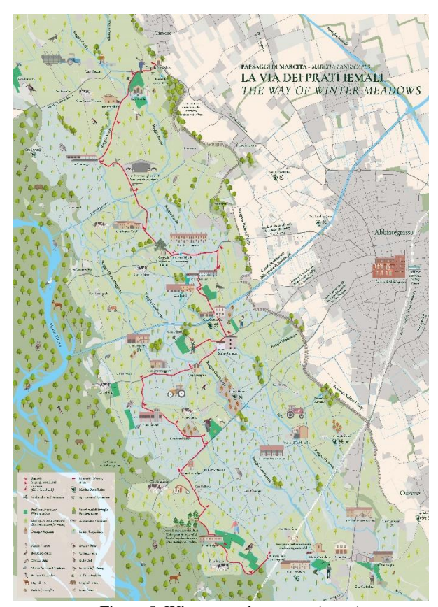
Figure 5. Winter meadows map (recto)

Map and graphic elaborations are the results of an interdisciplinary and expert work: a check of agricultural fields and farmhouses has been done by selected farmers, before the final editing phase. Nevertheless, the map itself is the output of long-lasting process (more than 30 years) of sharing and exchanging among the Ticino Park technicians and farmers: the map becomes a chance for the farmers to visualize and register their landscape as heritage and sharing it with the local community.