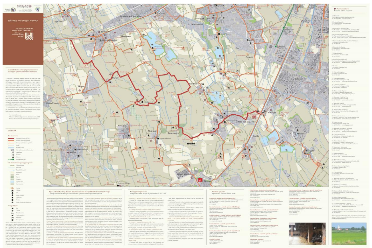
Figure 3. MUSA map (recto)