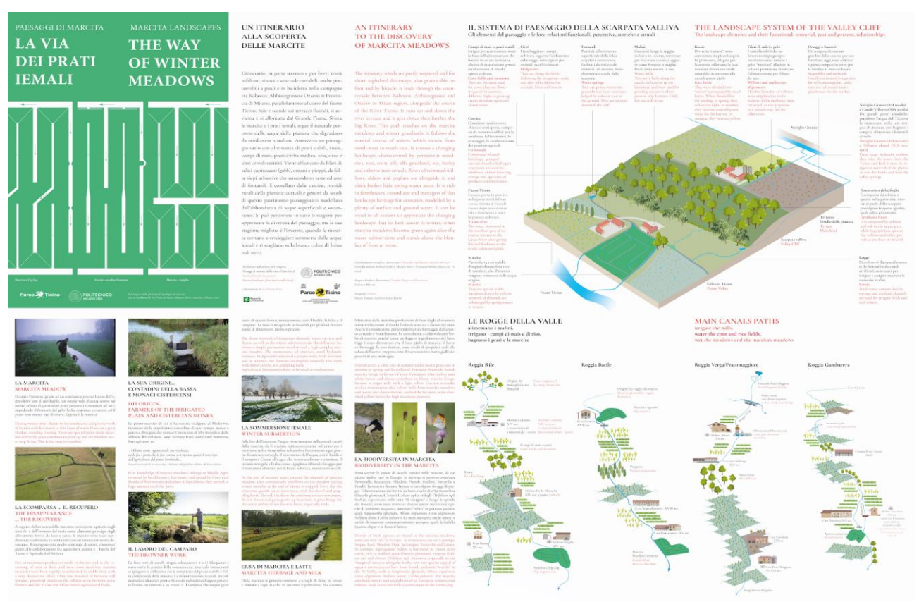
Figura 6. Winter meadows map (verso)