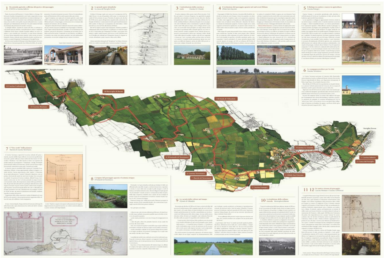
Figure 4. MUSA map (verso)