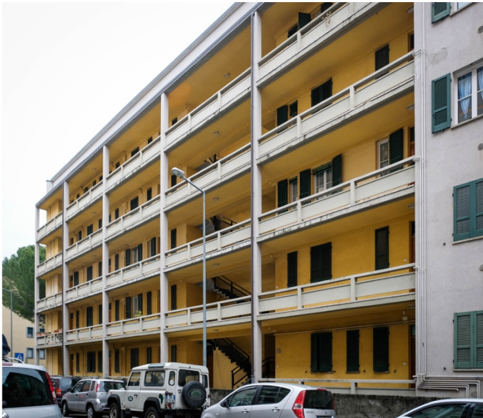
Figure 1. (left) External view of the Novocomum seen from Viale Sinigaglia, with the point of view at the northwest corner. Taken by the author in 2017. (right) External view of the Case Popolari seen from Via Anzani, with the point of view of main façade. Taken by the author in 2018.