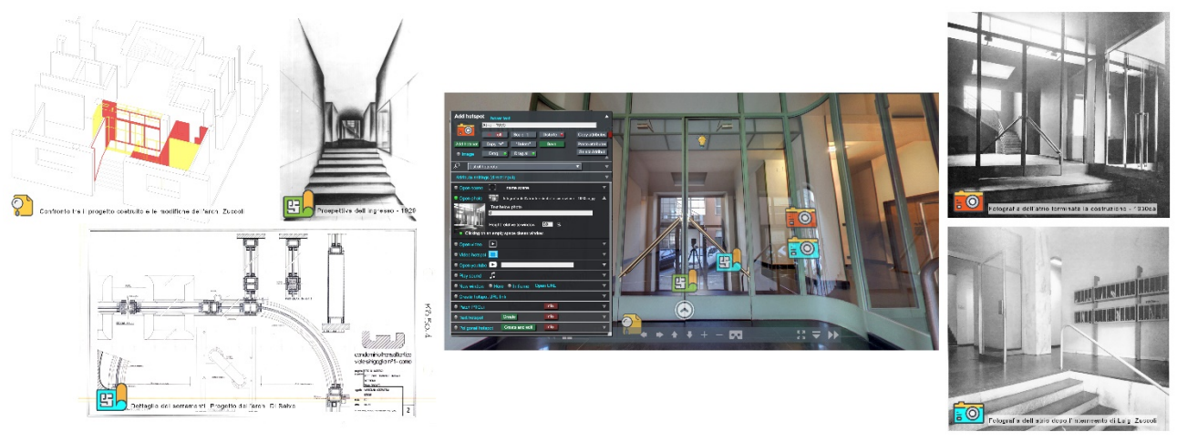
Figure 3. Novocomum. Screenshot of the virtual tour, in which are visibles the hotspots of the connected documents. As described in detail in the text, the icons referring to individual documents have different shapes to indicate the various types of documents, but also different colors that recall the different design, construction and transformation phases of the building. The captions below each document contain a summary information that can be used to identify it. In this panoramic image you can see (reported from top left): on the left side the reconstruction of the demolitions and reconstructions operated with the intervention performed by the arch. Luigi Zuccoli in 1957, the perspective of the entrance of 1929 (unrealized version), the drawings of the details of the window of the atrium designed by arch. Mario Di Salvo to carry out his intervention starting from 1987; on the right side the photograph of the atrium taken after the end of construction in 1930, the photograph of the atrium taken after the intervention of Luigi Zuccoli in 1957.