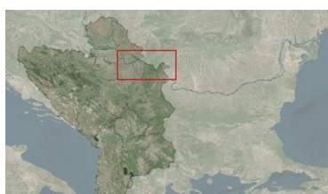
Figure 1. General view of the analyzed area

The results of the excavations carried out due to the construction of the dams were published mostly in periodicals. Probably the most important publication about these archaeological areas is "Starinar", the official periodical of the Institute of Archaeology in Belgrade, especially the volumes XXXIII-XXXIV.