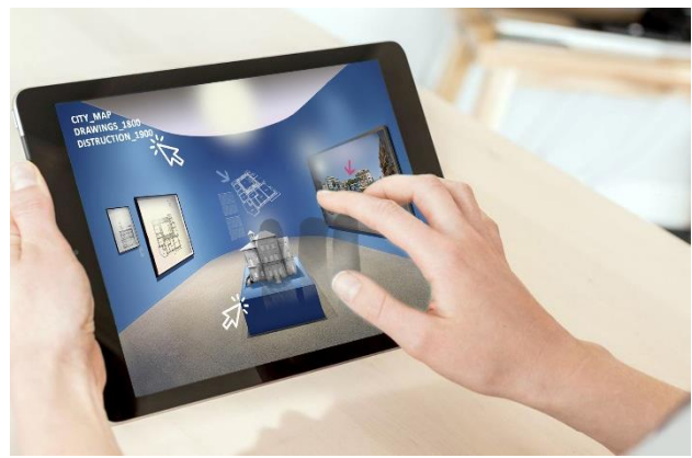
Figure 7. The image shows the way to use a hypothetic app with which the user can immerse himself in the virtual exhibition and have all the desirable information (graphic design by A.R.D. Accardi, 2019)

Inspired by the variety of the contents of the database, the creative project could also include the subdivision into various themes, such as the architectural style, the social and cultural context, the history of the city and its evolution, its characters, the graphic representation and realization techniques of projects, etc., in an atmosphere of sensory experimentation to be experienced in this "exceptional" virtual context (Figure 6). The public could thus have a clear image of the building, of its construction systems, of its spatial quality, as well as of the design skills of those who conceived it and, last but not least, have the opportunity to experience it as if it still existed and perhaps discover the daily lifestyles of those who lived in those architectures. Thus, the "Virtual Heritage" to which we refer has a much more representative and evocative meaning that goes far beyond "digital culture": according to our methodological approach, it is the processing of information associated with the asset that changes its character, interpretation, and value. We could say that the ultimate goal of virtual processing is the perceptive and cognitive increase of the thing-cultural asset as virtual heritage, digital access to the virtuality of cultural information (Figure 7).