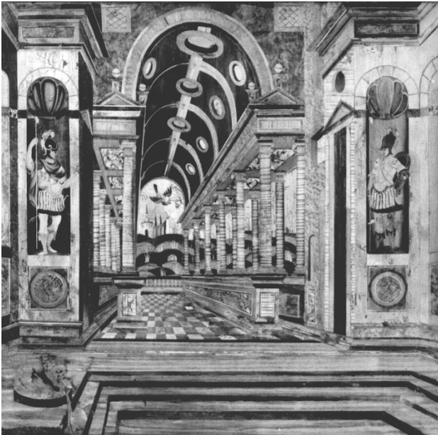
Figure 2. G.B. Vigilante, N. Ferraro, L. Duchà, T. De Vogel, wooden marquetry with architectural subject, Ceresa di S. Martino, Napoli 1590 c.

In fact, some representations often sacrifice verisimilitude in favour of beauty, or they prefer illusion to reality (Figure 2). Scholars must, therefore, be able to explain in an exhaustive and precise way, with the use of documentary accuracy and historical vision, the complex and fascinating reality behind every representation.