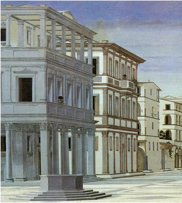
Figure 1. Città ideale (detail), Galleria Nazionale delle Marche, Urbino 1470-1490 c.