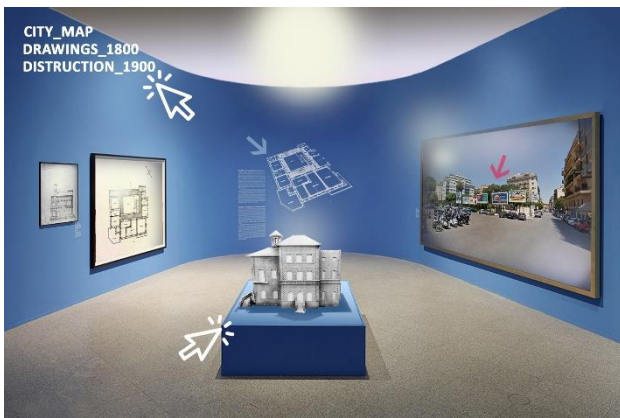
Figure 6. Virtual exhibition with different tasks about any possible thematic insight, personalized by users: the exhibition proposes the reconfiguration of a disappeared historic building (virtual exhibition by A.R.D. Accardi, 2019)