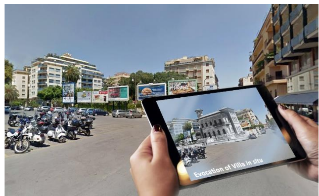
Figure 8. The image shows the use of the application in the outdoor environment, which helps to visualize the architecture (no longer existent) in its original context (graphic design by A.R.D. Accardi, 2019)

The virtual exhibition can, therefore, be considered an extension of reality and in some ways an enhancement of it, since it combines, in cognitive processes, perceptive and experiential aspects with the interpretative and symbolic aspects of meaning (Sabbatini, 2003). Through the virtual exhibition, we can actually re-establish the network of relations that connect the cultural object to its context of origin, to the territory, to the anthropological, historical, philosophical and social, technical and artistic themes of which the object is an expression.