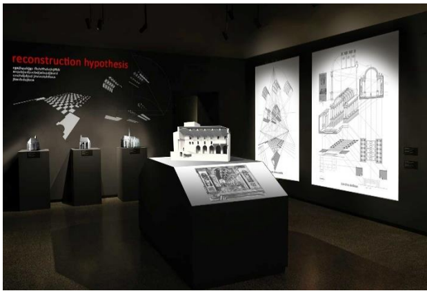
Figure 5. Virtual exhibition. One of the hypothesis of drawn architecture reconstructions (virtual exhibition by A.R.D. Accardi, 2019, drawings by S. Chiarenza)

This is the case, for example, of non-rigorous perspective iconographic representations (in which it is necessary to cross geometric results with data deduced from historical-documental analysis) (Chiarenza, 2006), or from photographic representations that need more specific photogrammetric processing.