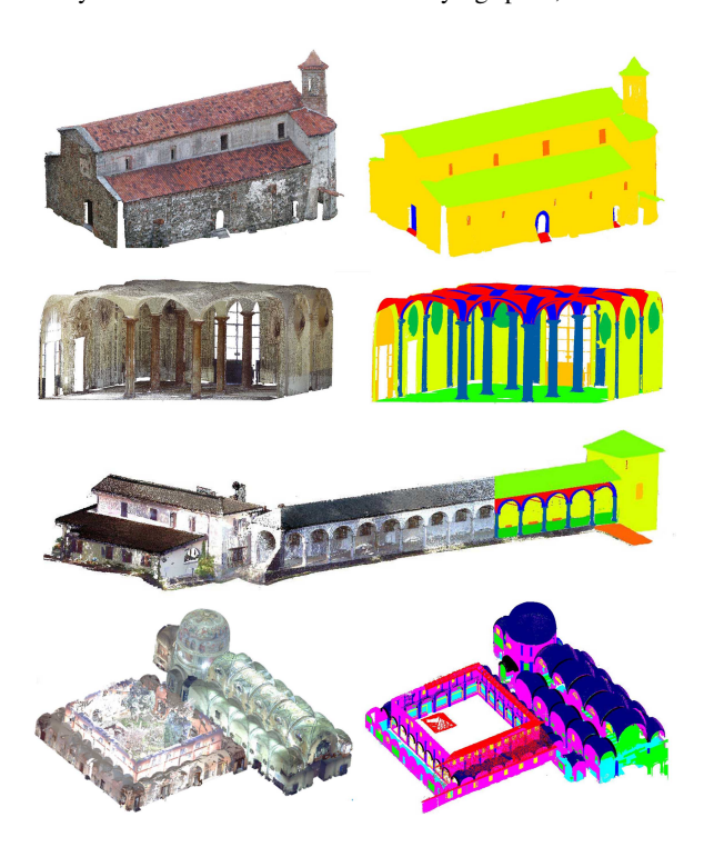
Figure 4. Visualization of architectural classes definition. On the left the scanned object, on the right each specific class.

• It partitions the set of points into overlapping local regions by the distance metric of the underlying space;