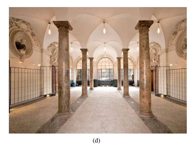
Figure 2. The four case studies used for the dataset creation and labelling.

this phase is done by a human operator, using various software tools as, for example, Autodesk ReCap 360.