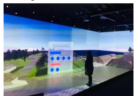
Figure 2. Test of the 3D model of the Intendance's palace in an immersive room.

Next, we added the elements directly into the virtual software Unity and chose the materials/textures for each of them. Aiming for an efficient yet realistic context, the computer researchers integrated a skymap to allow a change from day to night and back again. For navigation, the "ghost" mode was preferred, as it gives more possibilities of movement for the user to go in any direction without gravity. A main menu was created to explain the project and the controls and to allow the user to choose between an Edition mode (tr. edit mode) and a visualization mode of the initial hypothesis (Figure 2).