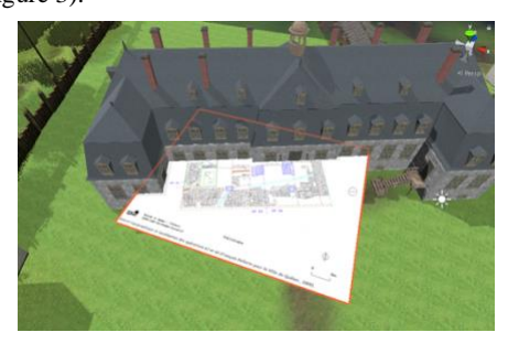
Figure 3. Archaeological excavation survey of 2009, which located the foundations of the staircase, inside the 3D virtual environment.

In this immersive environment that we created, the archaeologist was able to integrate archaeological excavations, surveys, historical maps and architectural plans related to the period of study (Figure 3).