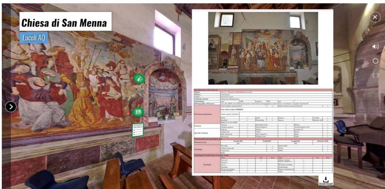
Figure 9. Virtual tour screenshot, SeVAMH form