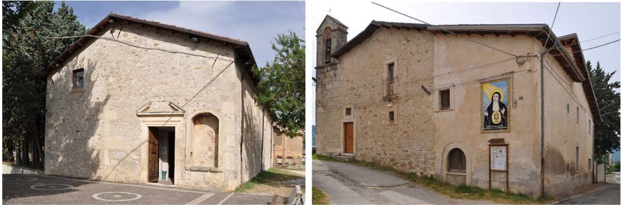
Figure 1. Panoramic views of the church

In addition to the valuable fresco, a seventeenth century altar, placed at the back of the nave added, hides another wonderful artwork ascribed to Pompeo Cesura, another major exponent of Abruzzi culture and Raffaello Sanzio's follower (fig. 2), and currently visible from the central altarpiece.