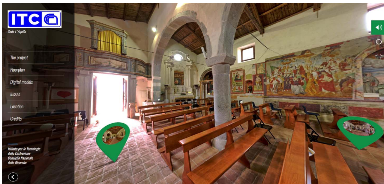
Figure 8. Virtual tour screenshot, in which are highlighted the hotspots, to move around the church, the audio content, active, and the menu