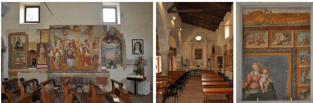
Figure 2. Internal views of the church: on the left, the wall frescoed by Saturnino Gatti and, on the right, the fresco ascribed to Pompeo Cesura