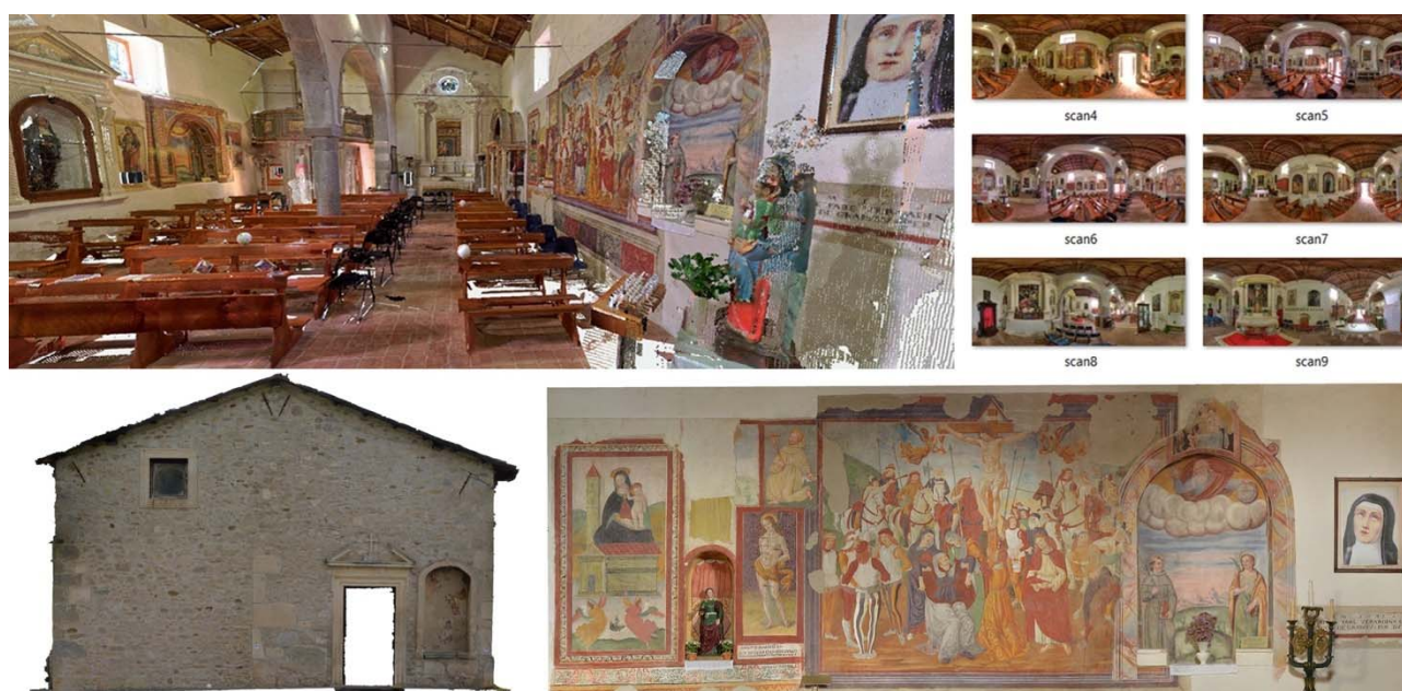
Figure 3. Point clouds and equirectangular images, top; orthophotoplans extrapolated from the textured photogrammetric model, bottom.

The virtual visit, in addition to its aim of enhancement and virtual accessibility of asset, is a very interesting and promising tool to manage and analyse efficiently and accurately the knowledge of artefact through controls that allow, thanks to the integration with the 2D images management software, to highlight the masonry identified with stratigraphic analysis, or the conservation state of frescoes. Similarly, it is possible to visualize for each artistic assets the main data collected by the SeVAMH protocol (fig.4).