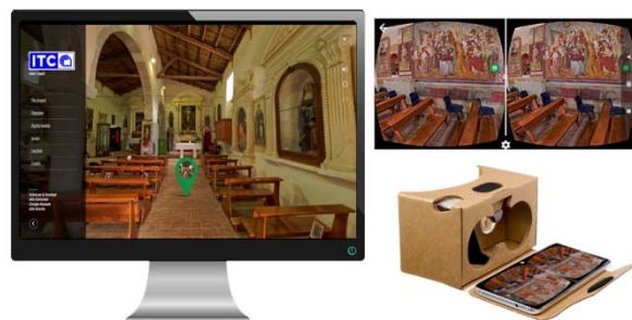
Figure 7. Different devices for the virtual tour.

In conclusion, the product resulting from multidisciplinary research becomes a useful tool, as well as to increase the accessibility to the cultural heritage and to the tourist offer, also for the management and exchange of data between the several professionals.