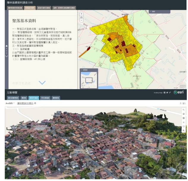
Figure 4. A result of integrated presentation of digitized reconstruction of historical sites at the Chiung Lin Village

Derived from the Geographic Information System, which was focusing only on the spatial representation in the past, Story Map has added the concept of time, and uses the storytelling technique to express relevant documentaries. The archival information that existed about a given historical event or time in the past, currently, it can effectively convey the changes of overall time and space background while combining with the space information provided by the Geographic Information System, the results of this project are shown in Fig. 4.