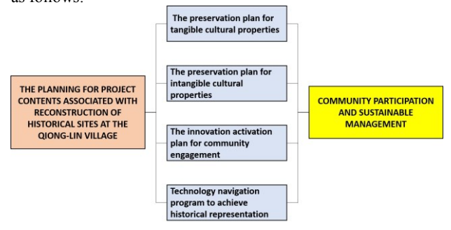
Figure 2. The architecture diagram of this project

This project primarily contains four sub-projects, including the preservation plan for tangible cultural properties, preservation plan for intangible cultural properties, community engagement and innovation activation plan, and technology navigation program for historical representation, the major architecture is as follows: