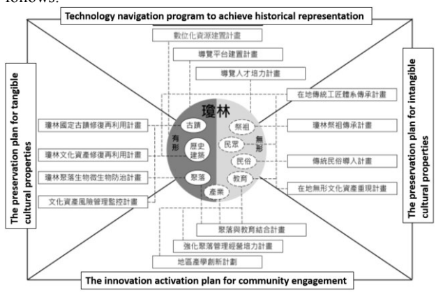
Figure 1. The relationship diagram for execution of this project

Affected by international trends, the recognition of cultural properties has tended to be diversification, and the interpretation and presentation of values is not merely depending on the architecture, history, and therefore, there is a necessity for integrating multidisciplinary and transdepartmental efforts, and in order to effectively demonstrate the values of cultural properties, it must be changed from a single point of architecture to the "field" with lines and dimensions, so as to effectively demonstrate the significance and value provided by cultural properties to the country, domestic area and the public. Based on the diversification of values of cultural properties, along with the trend of changing the concept of field from single point to dimensions as well as the operation of digital technology, the project of "Reconstruction of Historical Scenes" will facilitate in linking the relationship between land, people and cultural properties in order that tangible cultural properties will be effectively understood, interpreted, preserved and value-added, allowing intangible cultural properties be able to sustainable inheritance, under this circumstance, it will make cultural properties be able to combine with other industries to construct a complete preservation system for cultural properties. The relationships involve the execution of this project is as follows