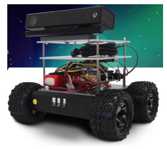
Figure 1. ARAS rover

This rover is able to provide a continuous TPVA solution, both in local or global coordinates and regardless of indoor or outdoor scenarios. Hence, the TPVA solution will take into consideration only the available sensor's data at the moment of the processing.