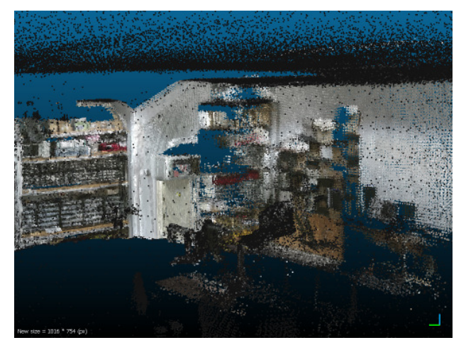
Figure 4. RTABMAP model of our laboratory

A variation of the example above would compute mapping solution in real-time but log these data to permanent storage instead. This capability is of special relevance in emergency scenarios where quick charting is required (Angelats and Navarro, 2017). ARAS would collect raw data of positioning and perception sensors and would process it on-board. Thanks to its obstacle and avoidance module it is able to autonomously map an entire floor. Once the acquisition mission finish, the user can download the processed point cloud and start its processing. ARAS is now providing 3D point cloud with 10 cm precision and 20 cm, accuracy after 5 minutes of mission.