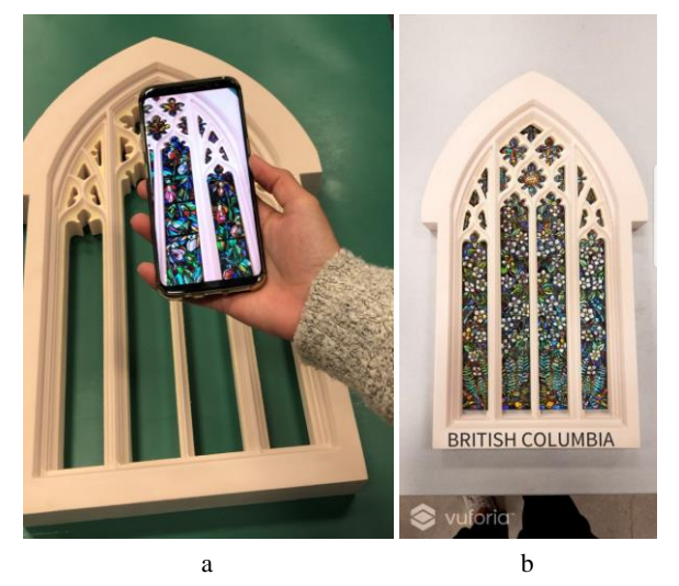
Figure 6: a) AR experience. b) Screenshot of the AR app.

Afterwards it is necessary to develop the Android application. In this case, the System Development Kit (SDK) of Vuforia Engine for Unity was used to build the AR Android app and to create the scenes that are described above. The scene in Unity was configured by adding all the elements that the camera of an AR app like Vuforia requires to realize an AR experience including image targets, illumination, as well as the virtual content. Finally, a swipe gesture was added to the screen so the user can change the displayed stained glass window by swiping the screen from right to left. Figure 6 shows the final result of the AR app.