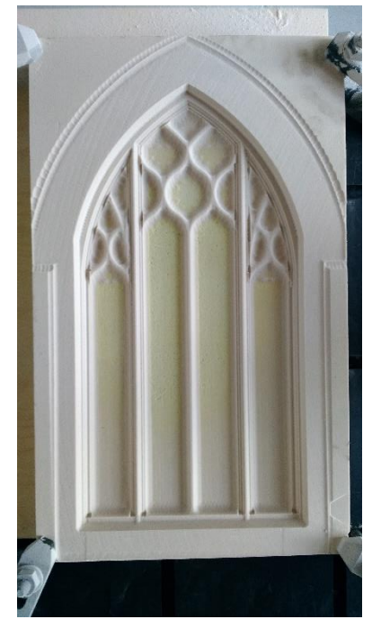
Figure 3: Milling process showing layer of glue.