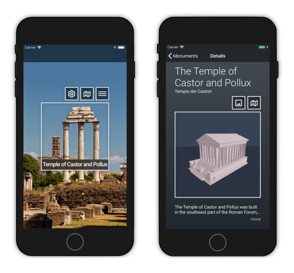
Figure 4. Screenshots of the App. The main page shows the camera monitor, a square to frame monuments and the prediction label. The monument page hosts a description, the interactive 3D reconstruction and buttons to show images and maps.

The International Archives of the Photogrammetry, Remote Sensing and Spatial Information Sciences, Volume XLII-2/W9, 2019 8th Intl. Workshop 3D-ARCH "3D Virtual Reconstruction and Visualization of Complex Architectures", 6–8 February 2019, Bergamo, Italy