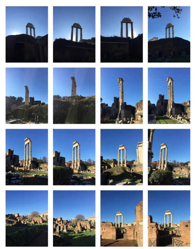
Figure 3. Sample from the original (not augmented) set of training images for the Temple of Castor and Pollux. Panoramic views and pictures showing not optimal lighting conditions were maintained to simulate user's conditions.

The storage used by the resulting Core ML model is 13.1 MB, achieving the goal of a light weight recognition engine that does not need a network connection to provide a basic information on the selected monuments. We expect this same model to be capable of recognizing about 1000 monuments without sensible loss of accuracy.