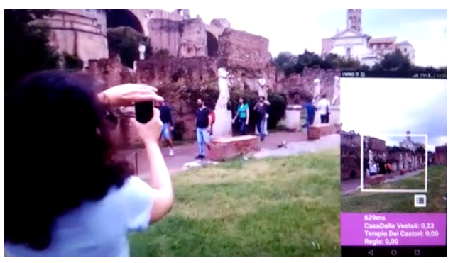
Figure 2. Field tests of an Android prototype of the recognition app.

More limited experiments were conducted using Android prototype apps. These were developed using the Android Studio IDE (Google Inc., JetBrains s.r.o., 2018) (Figure 2).