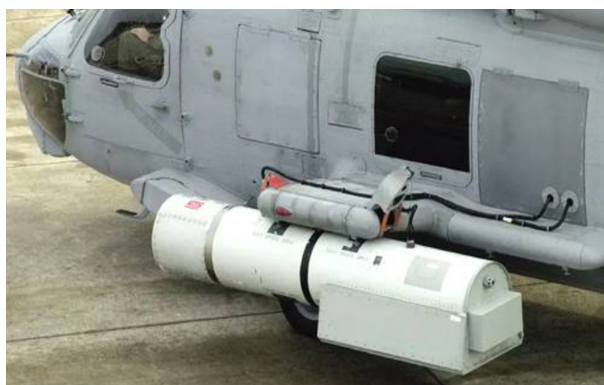
Figure 2. Magic light Airborne Laser Mine Detection System Installed on MCH-101 Sea Devil Helicopter