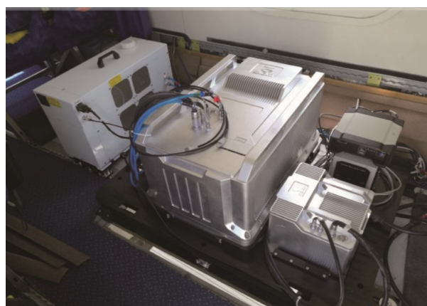
Figure 3. Mapper5000 System of Shanghai Institute of Optics and Machinery (He et al.,2018)