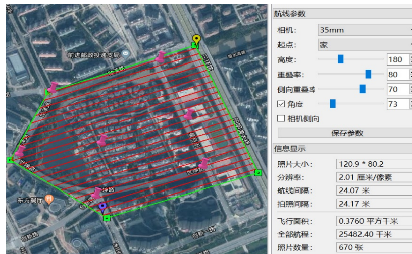
Fig.1 Route planning and image control point layout