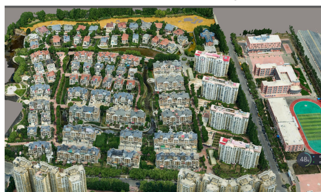
Fig.2 Real 3D panorama of the community

Considering the large storage capacity of the point cloud generated by aerial triangulation, and the operation memory of the computer is required during the generation of the real scene 3D model. A workstation is used for data processing. The running memory is 32G, and the model is set to 60×60 meters after being partitioned by plane rules. The RAM required by the model is 8G. The 13 machines in the local area network are built into a cluster to jointly produce the real scene 3D model. The final three-dimensional panoramic image of the community is shown in fig.2.