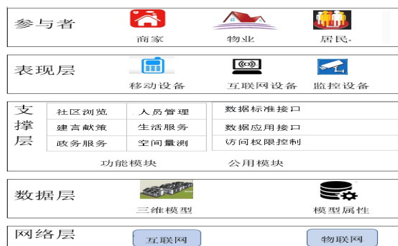
Fig.4 The logical structure of the system platform

As the support of the whole system, the network layer mainly includes the network environment, system organization and communication link created by the Internet and the Internet of things [12].