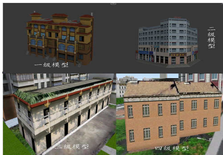
Fig. 3 Comparison of models at all levels

levels according to whether the building details need to be modeled, including plane, concave and convex length, plane position error with the actual object, height difference and the number of individual model faces. The required technical parameters for modeling at all levels are shown in tab.2, and the models at all levels are shown in fig.3.