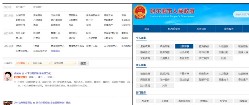
Fig.7 Life service and government service

register to find the services that meet their needs through the link. The government service window is linked with the official website of Harbin municipal people's government, and all government affairs needs are handled according to this notice.