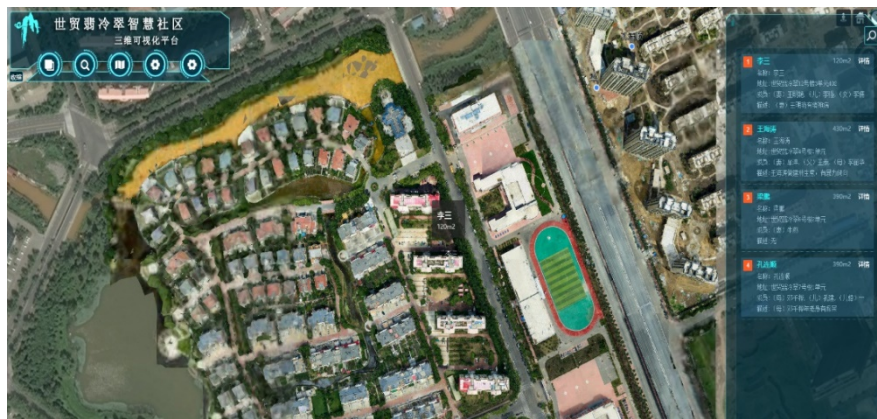
Fig. 6 people management function

authority. When the name of the person to be searched is output, the platform will automatically lock the building model that the person belongs to and display the property information of this model on the model, including name, address, housing area and remarks. Remarks mainly include special situations in the family, such as the elderly, the disabled, drug addicts, and persons with criminal convictions, etc., through which the manager is reminded to pay attention to the situation and better serve the community residents. If the community resident user information has changes, the manager can directly go into the database to update the document for adding, deleting and checking. Personnel management is shown in figure 6.