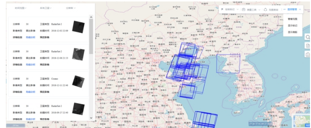
Figure 4. Platform data management

area to be read. At the current resolution, the size of the area to be read defaults to the size of the display window, if it is to be read. The essence of image scaling is to resample the image, the amplification is upsampling, and the reduction is downsampling. This platform mainly uses the nearest neighbor pixel method for resampling. Platform data management display interface is shown in Figure 4.