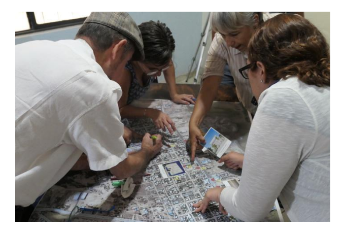
Figure 2. Participants using images from the toolkit to locate familiar places

Relationships was assessed for individual variables (study level) or questions such as: If there is a hurricane warning do you use some kind of measurements to prevent affectation in your house?; Had you make modifications to your house to reduce flood impacts?; After and hurricane do you ask for help to the local government?, and Do you feel prepared for storm or hurricane? Additionally we created an integrated socioeconomic index as a proxy of wellbeing. We added all positive answers to the questions in your household you have: sink, washing machine, gas stove, solar heater, conditioner air, TV, Flat screen TV, Cable TV, internet, desktop computer, laptop computer, microwave oven, refrigerator, electric iron. We used and equal interval classification approach to group the number of answers in three groups: 1 - 5, 6 - 10 and 7 - 15 as a low, medium and high socioeconomic index.