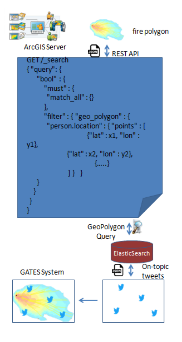
Fig. 3 – Filtering on/off-topic tweet messages in the Big Data cluster